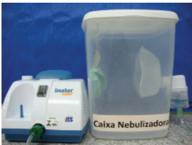
Fig. 2. Nebulizer Box.