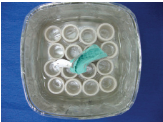
Fig. 1. Humidifier Box.