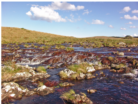
Figure 3 – Habitat of Ephebe brasiliensis found in Rio Grande do Sul state, Municipality of Cambará do Sul, National Park Serra Geral.

Future studies are important for conservation strategies of the species, and we postulate that E. brasiliensis probably presents an even wider distribution in South America.