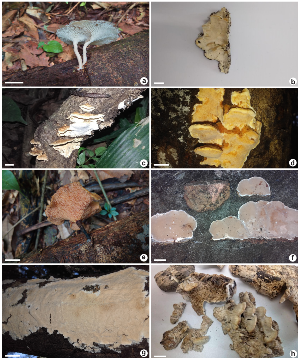
Figure 2 – a-h. Macromorphology of the basidiomata – a. Lentinus arcularius (Cláudio et al. 355); b. Oxyporus populinus (Cláudio et al. 436); c. Perenniporiella neofulva (Cláudio et al. 193); d. Physisporinus lineatus (Cláudio et al. 404); e. Polyporus guianensis (Cláudio et al. 352); f. Rigidoporus ulmarius (Cláudio et al. 161); g. Steccherinum neonitidum (Cláudio et al. 202); h. Trametopsis brasiliensis (Cláudio et al. 228). Scale bar = 1 cm.