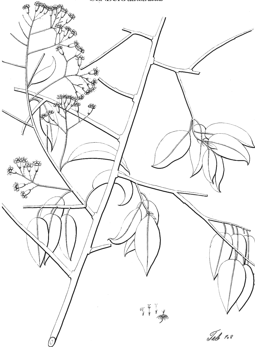
Figure 2 – Original parchment plate of Vellozo, here designated as lectotype of Senecio desiderabilis , from Florae Fluminensis in the Manuscript Division of Biblioteca Nacional, Rio de Janeiro (cat. no.: mss1198657_112), showing a flowering branch with details of a ray-floret, a disc-floret, a dissected floret showing the style, and an opened capitulum with a cypsela attached to the receptacle.