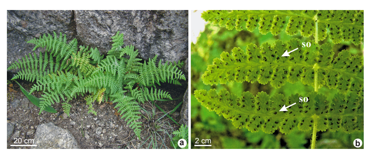
Figure 1 – a-b. Sporophytes of Physematium montevidensis – a. habit; b. detail of a fertile frond. so = sorus.

Materials were placed in paper envelopes and transported to the laboratory where they were maintained at room temperature (20–25°C) until spore release. The remains of sporangia were eliminated by a mesh with pores 88 \mu m in diameter. The spores were not sterilized before sowing. They were cultured in previously autoclaved (120 °C for 20 minutes) Petri dishes 9 cm in diameter, containing Dyer liquid medium (Dyer 1979). The dishes (10 repetitions) where sealed with Parafilm and placed in a growth chamber with a photoperiod of 12 hours under white fluorescent illumination 28 \mu mol m<sup>-2</sup> s<sup>-1</sup> at 20±2 °C. The cultures were