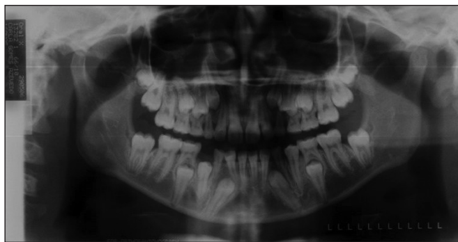
Figure 2 - Panoramic radiograph