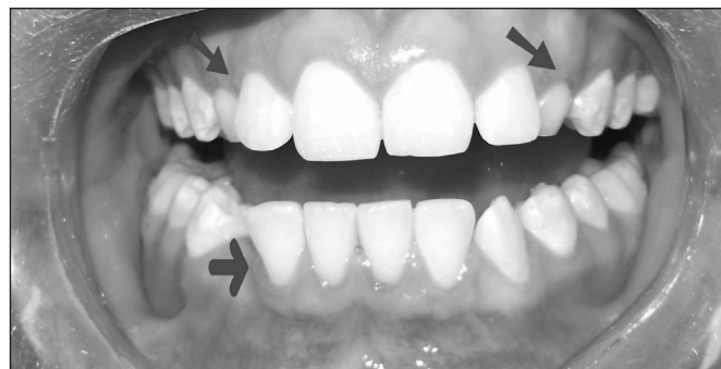
Figura 3 - Erupted permanent teeth and enamel defects in late erupted teet

(82.0–98.0); MCH 30 (26.0–34.0); white cells (3500–10500) 4640/mm 3 (39S/1E/2.6B/49.3L/7.6M); platelet count 236000/mm 3 (150000–450000). Serum iron level was 24mcg/dL (37–170), and ferritin 58ng/mL (11–307). Hemoglobin electrophoresis and osmotic fragility curve were normal. Wrist x-ray revealed bone age of 13 years with chronological age of 16 years according to the Greulich-Pyle Atlas, with a standard deviation of -3.1. She was then referred to the endocrinology department for treatment and follow-up.