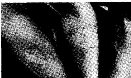
Figure 2. A 7 year old boy with total absence of nasal septum from mucosal leishmaniasis and a 13 year old girl with positive graded skin tests on the left forearm and a characteristic scar on the right forearm. Such scars resemble burns being slightly depressed, hypopigmented and fibrotic.

endemic region is very low and present only at high antigen concentrations (4% using a dose of 9.6 \mu gN). In patients with active disease or a scar, skin reactivity increased with the antigen concentration. There was no difference between these two groups in the number of positive skin reactions at the highest concentration. The highest concentration (30 \mu g/0.1 ml) however was unacceptable since it occasionally caused necrosis at