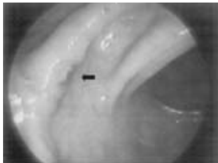
Figure 3A - Colonoscopy. Upper: plane ulcerated lesion, in transverse colon.

bowel irregularity in the jejunoileal region. Colonoscopy showed in transverse colon a 5 mm plane ulceration with erythema, surrounded by a white border (Figure 3A); and in the splenic flexure an edematized ring-shaped ulcerated lesion, with elevated borders, and precise limits, covered by fibrin