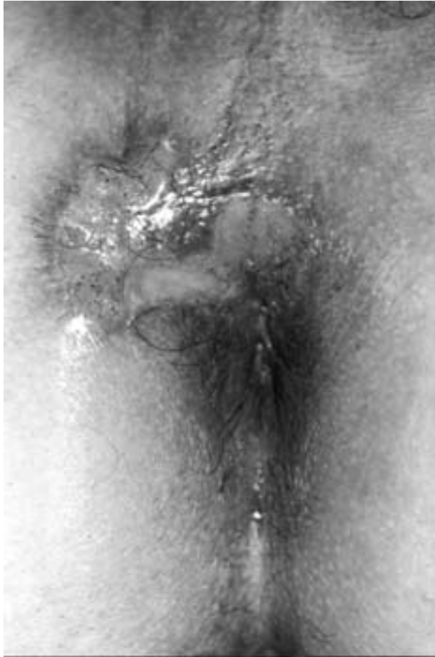
Figure 1 - Anal lesion caused by Plasmodium brasiliensis .

bowel irregularity in the jejunoileal region. Colonoscopy showed in transverse colon a 5 mm plane ulceration with erythema, surrounded by a white border (Figure 3A); and in the splenic flexure an edematized ring-shaped ulcerated lesion, with elevated borders, and precise limits, covered by fibrin