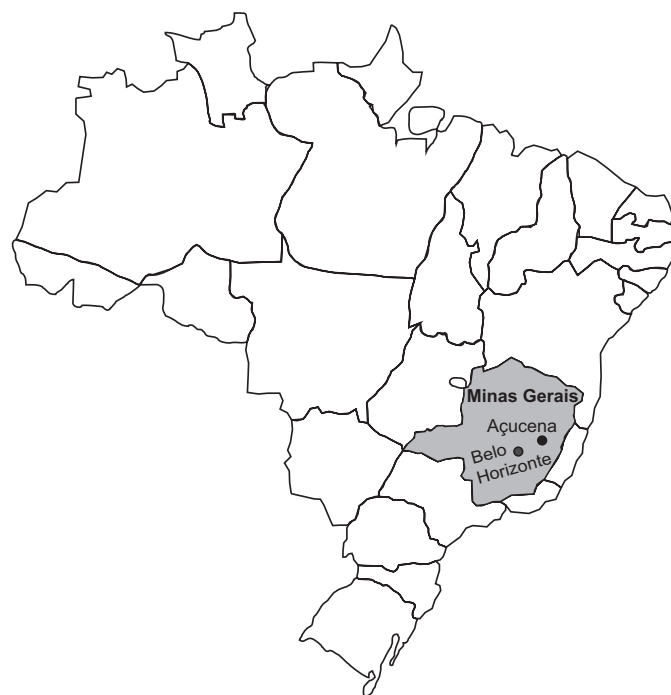
FIGURE 1 - Location of the Açucena Municipality, East region of the State of Minas Gerais, Brazil.

Three parameters were used for sample calculation: I) the proportion of individuals infected with T. cruzi in the age group studied in the national investigation of Chagas disease between 1975 and 1980 9 ; II) an acceptable error of 5%; and III) the number of schoolchildren in the rural zone of the municipality. In the absence of data related to the first parameter, a proportion of 41-50% of the total schoolchildren was used. The sample size was increased to 50% for greater reliability and was higher than that recommended for the period by the Health Ministry 9 . The number of children by age group and by school was calculated to estimate who should be examined. Children were stratified