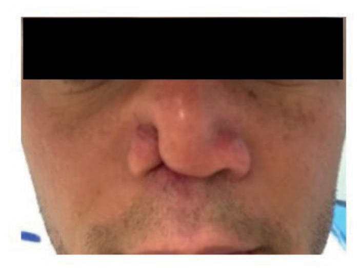
FIGURE 2: Nasal collapse on the right.

Serology for leishmaniasis was IgG-positive and IgM-negative and non-reactive for paracoccidioidomycosis. Nasal mucosa histopathology showed ulcerated squamous mucosa with seromucous glands in the chorion. There were marked acute and chronic inflammatory processes with a giant cell reaction (Langhans cells) and epithelioid histocytes, compatible with a diagnosis of leishmaniasis ( Figure 3 ). Nasal fragment polymerase