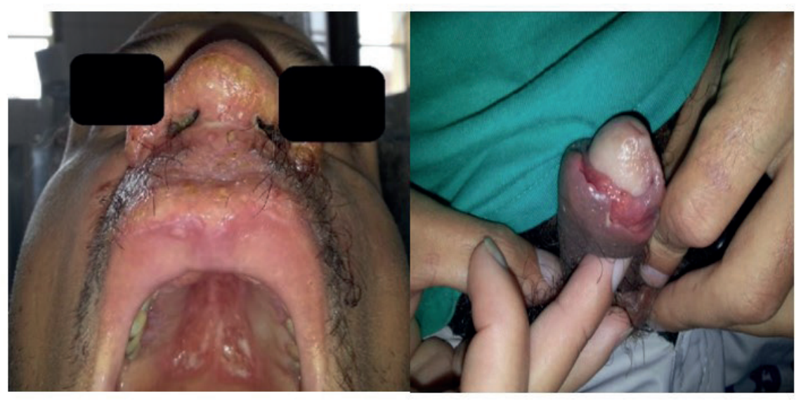
FIGURE 1: Characteristic ulcerated lesion with exudation and infiltration in the nasal base, filter, palate, and balanoprepucial sulcus.