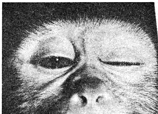
Fig. 1 — Orbital oedema in monkey 26 at 9 days

The Peru strain of Trypanosoma cruzi induces a non-fatal acute infection in rhesus monkeys since a decline in parasitaemia is noted even in these short term experiments. The relatively mild tissue reactions and absence of leishmania other than at the site of inoculation is in keeping with this observation. A similar persistent multiplication at the site of inoculation has been noted in Beagle dogs (Marsden and Hagstrom, 10). Orbital oedema developed in all 3 monkeys with