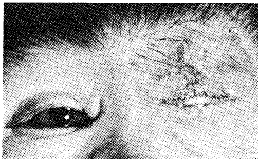
Fig. 2 Orbital oedema with ulceration in monkey 26 at 20 days.

this strain and was useful in assessing the progress of the infection. Such a reaction was rare in Beagle dogs inoculated in a similar manner.