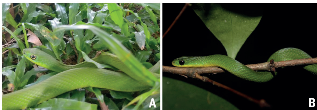
FIGURE 2. Green colored pattern of Philodryas olfersii that occurs in northeastern Brazil, resembling Erythrolamprus viridis . (A) P. olfersii ; (B) E. viridis .

Therefore, our report reinforces the precautions and care that professional or amateur herpetologists must take in handling many opisthoglyphous snakes. Although the number of envenomations caused by opisthoglyphous snakes in Brazil is low, and with reduced capacity of injecting venom, some cases of envenomation by opisthoglyphous snakes, such as Philodryas species, could be very dangerous and should be avoided.