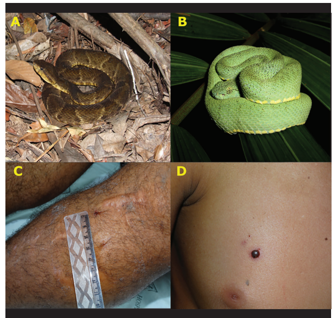
FIGURE 2: (A) Adult individual (150 cm) of Bothrops atrox hunting on the ground (Photo: PSB); (B) Bothrops bilineatus sleeping on a palm leaf during the day at 1.4 m height (Photo: Saymon de Albuquerque); (C) Bite caused by adult B. atrox specimen (150 cm length) (distance between punctures = 3 cm) (Photo: AMS); (D) B. bilineatus bite to the thorax (Photo: AMS).