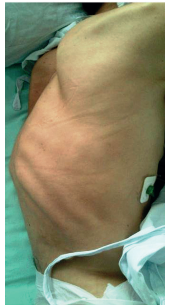
FIGURE 1: Thoracic kyphosis.

Received 21 July 2020 Accepted 17 August 2020