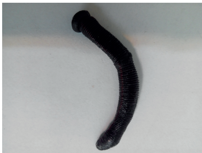
FIGURE 2: The relaxing mode of the 6-cm leech.

provided on the causes of vaginal bleeding in minors in Iran. Bleeding due to leech infestation is caused by anticoagulation agents in leech saliva, which can significantly increase blood coagulation time due to their anti-thrombocytopenic properties 10 . Moreover, leech saliva also has platelet anti-aggregation properties which can prevent platelets from clotting in order to stop bleeding.