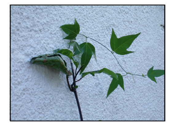
Figure 1 - Asymptomatic P. suberosa grafted onto CABMV-SPinfected P. edulis f. flavicarpa .

who reported the species as being apparently immune