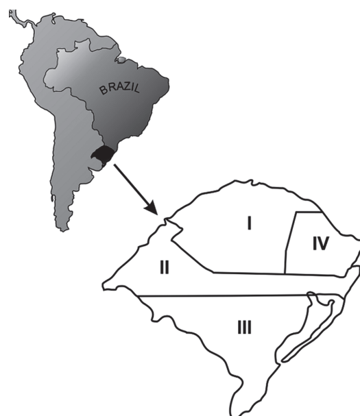
Figure 1 - Map of Rio Grande do Sul showing soybean cropping regions.

The number of years in which each genotype was assessed varied from one to three, except for the