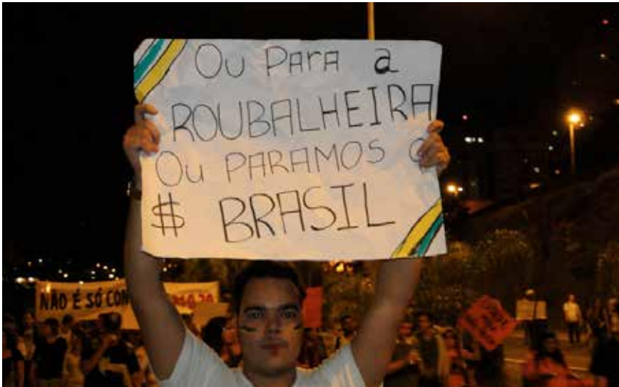
Belo Horizonte “Either stop the thieving or we stop $ Brazil”

On the other hand, political demonstrations, in the synthetic form of the banner, tend to show a very low level of tangibility. Accusatorial, they feature a monologue of slogans without any need for proof of what is claimed, at least within the bounds of the street protest. For example: