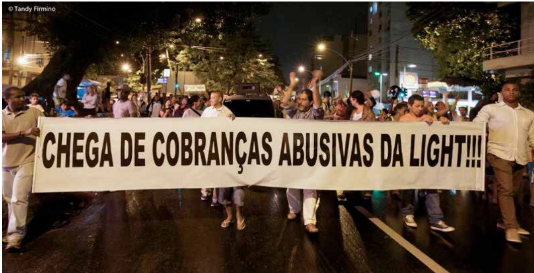
Rua São Clemente, Botafogo, Rio de Janeiro, 25/03/2014