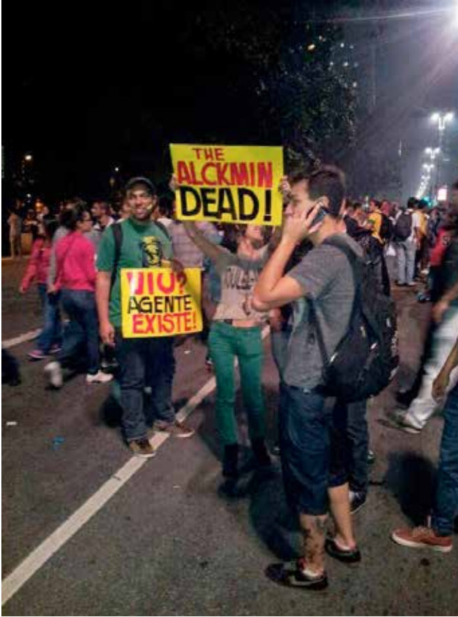
São Paulo