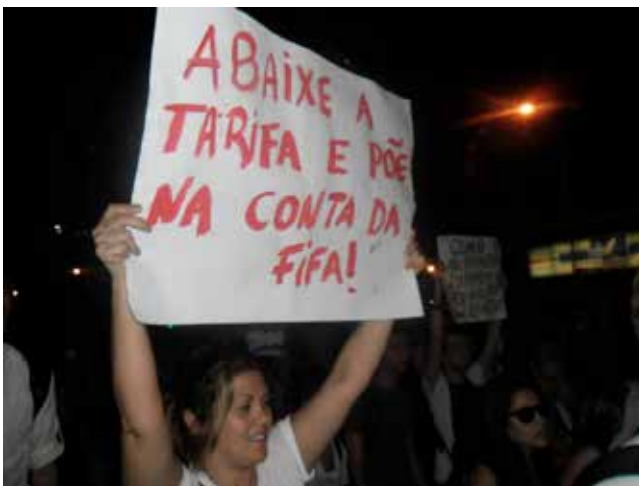
Rio de Janeiro "Lower the fare and put it on FIFA's bill!"

A critique is always linked to a comparison between how the world is (problematic) and how it should be. The construction of an alternative and realizable utopia (Boltanski, 1990: 150-151) is not always mobilized by critics, though – in other words, a critique is not always propositional, presenting an alternative. It may be purely negative, rejecting the undesired situation through the mere assertion of its negativity. As an example of the former, we have: