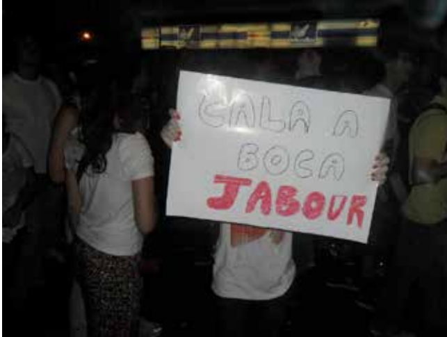
Rio de Janeiro "Shut your mouth Jabour [sic]"