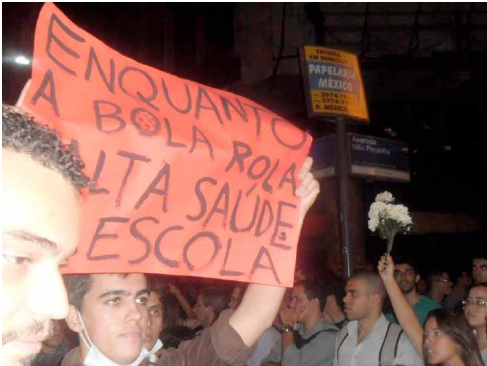
Rio de Janeiro “While the ball is rolling, healthcare and school are missing”

By contrast, in the more traditional version, the explicit critique, a path is established that is concentrated precisely on the realization of the elements made explicit – they will have to be proven and legitimized as the critique evolves without depending on the revelation of a subjacent concealment. As an example we can take another poster, entirely explicit about the problem (the lack of healthcare and education) and its culprits (the promoters of mega soccer events that compete for resources with these social goods):