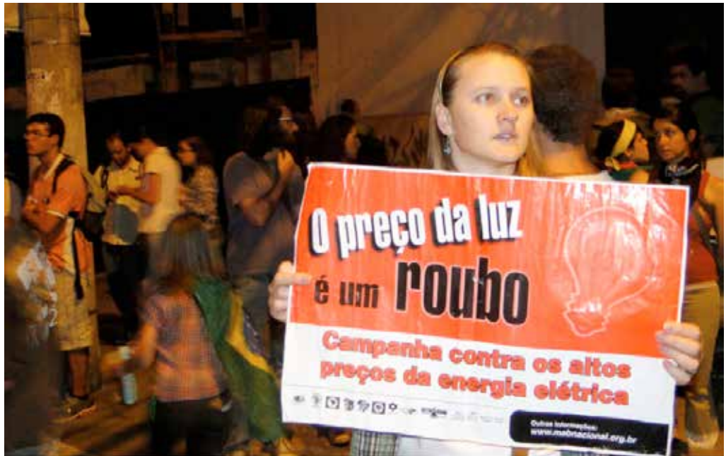
Belo Horizonte “The price of electricity is a robbery. Campaign against high electricity rates”

The path taken here is very different to the one observed in most of the critiques presented during the June Uprising. The discursive form of protests is generally accusatorial, following a logic of denunciation (Boltanski, 1990): people go into the streets to say that the powerful have done something unacceptable and to monologue against them, not for them to reply in order to justify themselves. 14 This poster, for example, which coincidentally unites our fields made, in the streets in 2013, an explicit accusation concerning electricity prices: