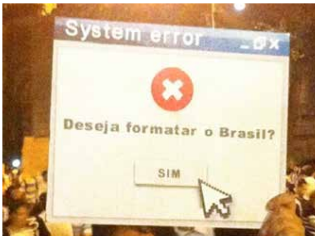
Rio de Janeiro “System error. Do you wish to format Brazil? YES”