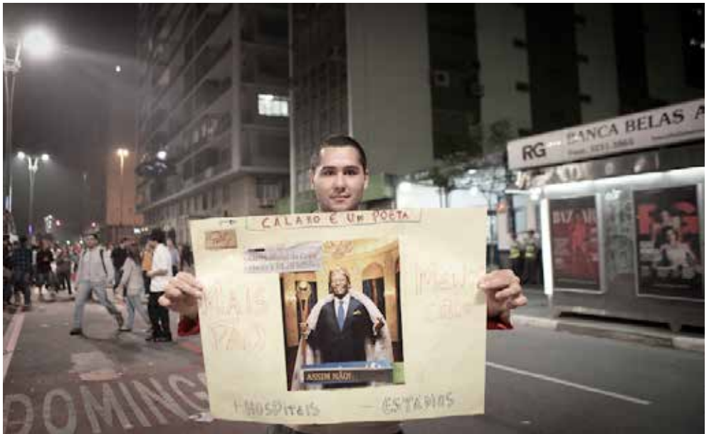
Avenida Paulista, São Paulo, 20/06/2013