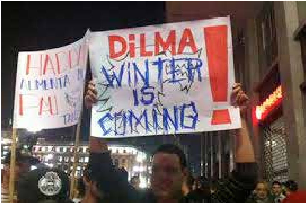
São Paulo

By way of contrast, we can turn now to the case of demonstrators and their posters. For example: