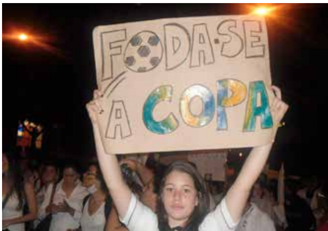
Rio de Janeiro “Fuck the cup”

In other examples, the young people participating in a demonstration during the June Uprising in Rio de Janeiro do not mince their words. They performed their demonstrations aggressively, showing their opponents that their position is energetic. In the first example below, the object of the critique is disqualified; in the second, the interlocutor (in this case, newspaper and TV journalist Arnaldo Jabor – called 'Jabour' on the banner – who criticized the demonstrations):