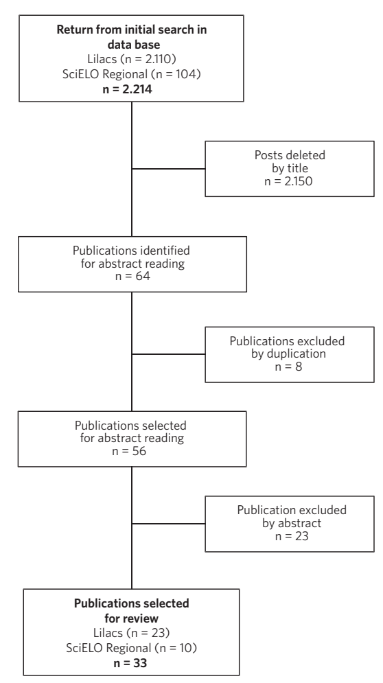
Figure 1. Flowchart of integrative literature review

Initially, 2,214 articles were found, 2,110 in Lilacs and 104 in SciELO Regional. The reading of the title was carried out, excluding 2,150 articles unrelated to the issues of interest, resulting in 64 for reading the abstracts. Of this total, 8 articles were duplicated, remaining 56. After this step, 23 articles were excluded for not being related to the issues of interest according to the summary, resulting in 33 articles for analysis, 23 in the Lilacs database and 10 in the SciELO Regional, as illustrated in figure 1 .