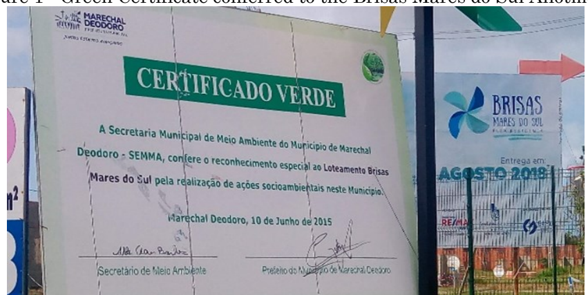
Figure 1 - Green Certificate conferred to the Brisas Mares do Sul Allotment.

The development of these allotments have caused several socio-environmental problems in the area, besides producing, under mechanistic logic, segregated spaces that, for the most part, do not meet the land and environmental regulations. However, in 2015 the public power and the city council legitimized the occupation of this space, conferring licenses and even "green certificates" that are displayed in front of the enterprises, as is the case of the Brisas Mares do Sul Allotment (Figure 1).