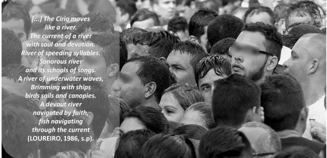
Figure 5 - The \it Cirio is a multitude of walking waves. A river of the devout.

Figure 5 associates the poem "The Taper" to a hub of procession followers, dense and teeming, like fish in the "current of a river with soul and devotion", a "school of songs" carried by the "underwater waves". A devout river, incapable of being fully understood only in terms of the millions of visitors in the procession. We know that other Círios , in the countryside of Pará, before and after the Belém October, attest to this capture of the collective body "navigated by faith". However, the current captured in the local snapshot synthesizes this first humanist scale. There is no Círio do Nazaré festival without collective connection. Individuation is apparently exclusive to the Saint in the palanquin, though this is only the impression of the inattentive eye that sees/senses the whole without observing the details.