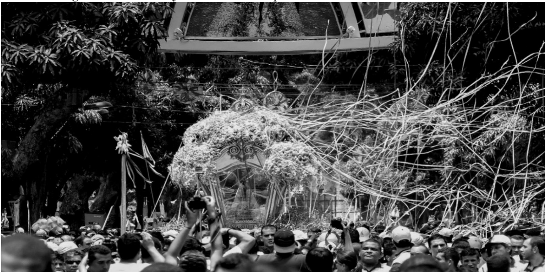
Figure 3 - Our Lady of Nazareth in performative return to the Basilica.

and of festivity. The festival is now universal, inscribed by UNESCO as an element of Intangible Cultural Heritage in 2013 and deserving of safe guarding. This makes the human pulsation a multiscale projection (both local as well as global) of the festival's representations in the liturgy of images. We observe this performative return of the Saint and her procession to the Basilica (Figure 3).