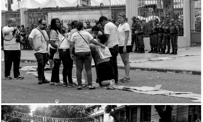
Figure 4 -Performative scenes fed by the spiritual utopias.