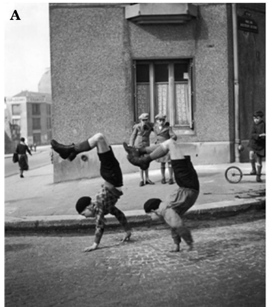
Figure 1 - Photo A: The brothers, rue du Docteur Lecène Street, Paris, 1934. Photo B: The carpenter in rue Saint Louis in Isle, 1947.

Moreover, according to Debray (1993), a national ethnography or anthropology of proximity was practiced, the focal point of which was the social life of the subject. Human beings are considered invisible, their jobs and daily life, the rituals, the celebrations of cultural traditions, political manifestations, picturesque figures and couples, portraits of artists and intellectuals (Figure 1) were introduced (AVANCINI, 2011). In this context, while humanist photography centered on people in their environment, it focused acutely on the most disadvantaged, clarifies Paviot (2019).