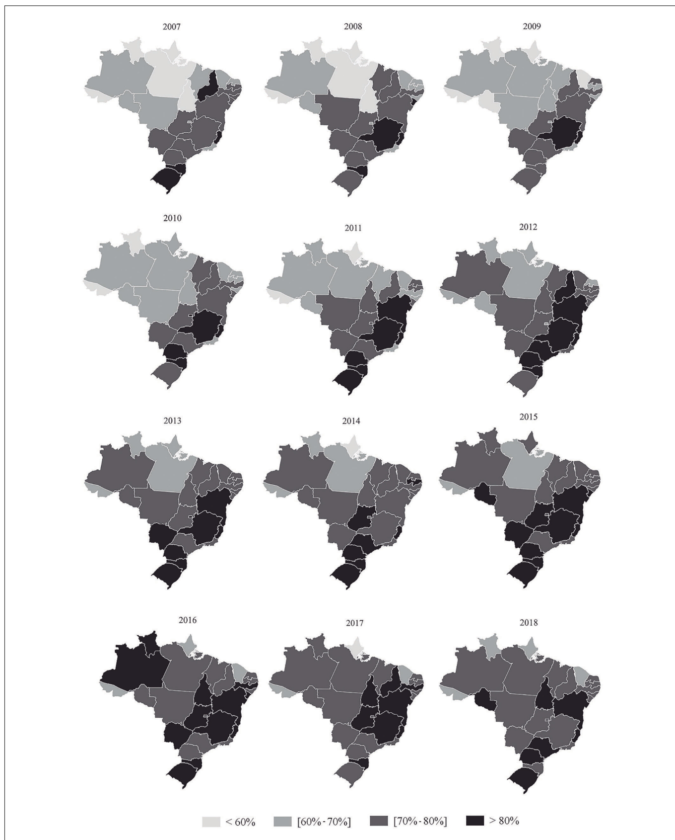
Figure 1. Frequencies of mammography coverage among women (50 to 69 years old) over the last two years in the Brazilian state capitals and in the Federal District. Vigilat; 2007 to 2018 (n = 385,555).