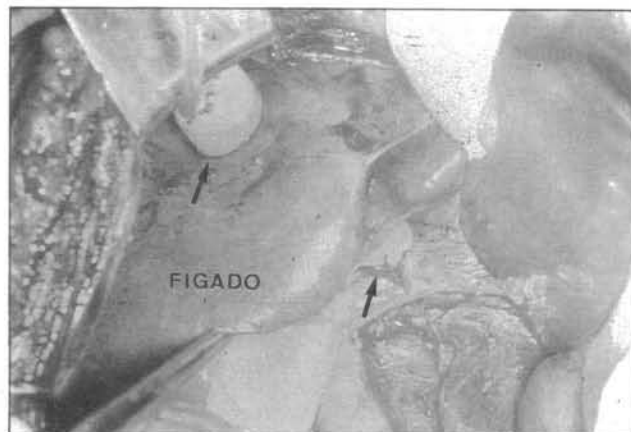
Figure 2 - Intraoperative aspect of balloon positioning (see arrows).

The tubular drain should contain three to four orifices so as to permit the introduction of fluid inside the laminar drain, transforming it into a balloon. The balloon should extend 4 to 6 cm beyond the path of the wound. The capacity of the balloon is verified with contrast fluid, so as to maintain it distended. When it is insufflated, with its ends located approximately 2 to 3 cm outside the path at both ends of the wound, it should take on the shape of dumbbells perfectly anchored to the liver parenchyma (Figs. 2 and 3).