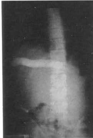
Figure 3- Radiologic aspect of balloon positioning (postoperative view).

After the occurrence of hemostasis was verified and the associated visceral lesions were corrected, the cavity was drained with a tubular-laminar drain exteriorized through the right flank, with the balloon coming out through a counter-opening in an incision separate from that of the abdominal drain.