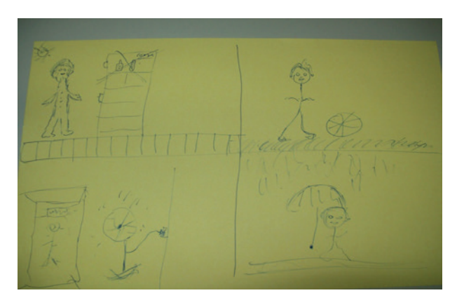
Figure 2 - Abel's artistic production: body-knowledge dynamics. Santa Maria-RS, 2011

rectly towards him! Then, the care in a rainy day, with the coat, umbrella, protecting him with shoes... [...]. I have attempted to say everything we try to prevent him to do! (Abel).