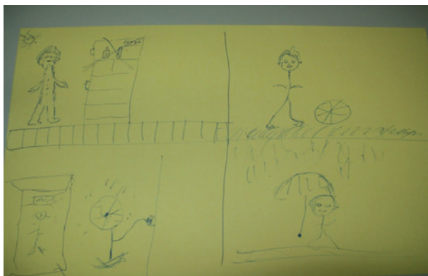
Figure 2 - Abel's artistic production: body-knowledge dynamics. Santa Maria-RS, 2011

rectly towards him! Then, the care in a rainy day, with the coat, umbrella, protecting him with shoes... [...]. I have attempted to say everything we try to prevent him to do! (Abel).