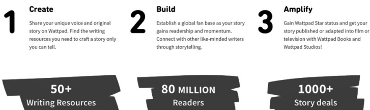
Figure 5. How Wattpad works

Get your story discovered through the power of community and technology on Wattpad.