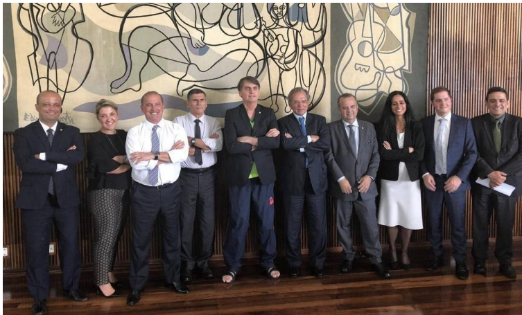
Figure 4. Bolsonaro wearing pajamas and flip flops, next to his ministers and advisors. February 14, 2019.