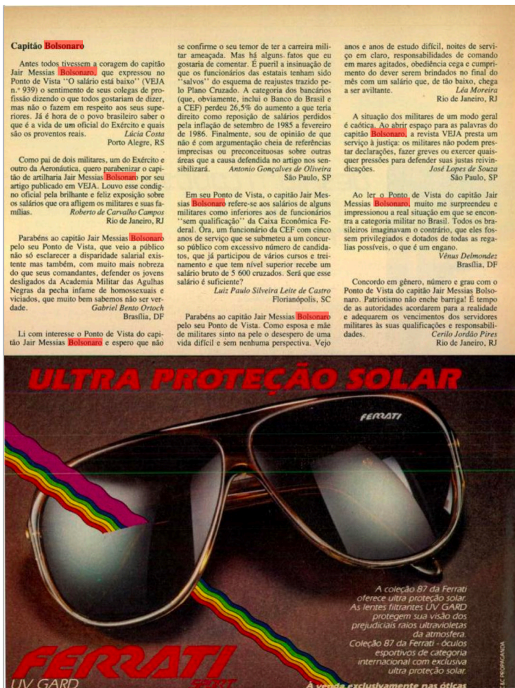
Figure 12. Letters from Veja's readers in support of Bolsonaro, Sept. 10, 1986

Differently from this linear circuit, Blommaert points that the circulation of political messages nowadays is much more fragmented, sectorized, and algorithmic-oriented (see also MALY, this issue; VARIS, this issue). Empirically, Cesarino has found evidence that in the contemporary digital networks, leaders invest in the illusion of non-mediation in social media. For instance, Bolsonaro's minister of education, Abraham Weintraub, has used Twitter to circumvent the official channels of communication in the ministry. During the massive complaints about the 2019