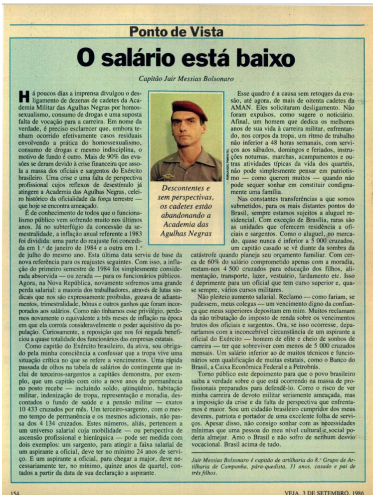
Figure 1. "The paycheck is low", op-ed article by Bolsonaro, Sept. 3, 1986

Under his picture: "Discouraged and without prospects, cadets are abandoning the Agulhas Negras Academy"