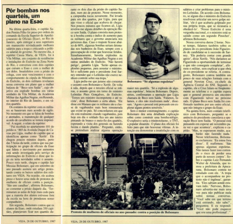
Figure 2. "Blowing up bombs in the barracks, a plan in the Army school." Veja , October 28, 1987.

Under Bolsonaro's picture: "It's only a few fuses". Under the lower picture: "Protest of officers' wives last year against Bolsonaro's imprisonment".