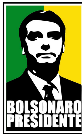
Figure 6. Bolsonaro's Presidential Campaign logo

This jocular, "popular" style is also pivotal for understanding Bolsonaro's relationship with truth. As I write this article, the entire world is being hit hard by the Covid-19 pandemics. Against the World Health Organization's (and his own Health Ministry's) concerns about the severity of the viral infection and guidelines of social isolation and distancing, Bolsonaro has urged Brazilians to go back to normal life by calling the disease a "gripezinha" and a "resfriadinho" (a minor flu and a minor cold). One of his derisive mediatic performances were publicized on