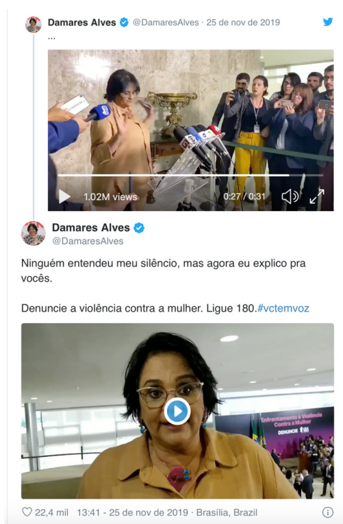
Figure 11. Minister Damares Alves' silent interview, November, 25, 2019 "No one understood my silence, but now I explain it to you. Report violence against women. Call 180."

these maxims, Grice argues, speakers generate implicatures, or implicit meanings, that hearers may guess by following, as rational agents, the Cooperative Principle. For instance, a recommendation letter for a post of mathematics teacher that says that the candidate has good handwriting and is never late for meetings flouts at least the maxims of relevance and quantity, for good handwriting is not relevant for excellence in math teaching, and good knowledge of the discipline is amongst the items to be listed in the quantity of information of such a letter. In Grice's rational model, Damares flouts at least the maxim of quantity, for she is completely silent and does not provide minimal information for a conversational exchange. Yet, at the same time, she is not willing to cooperate at all: her interview is a non-interview; her communication is the breakdown of communication.