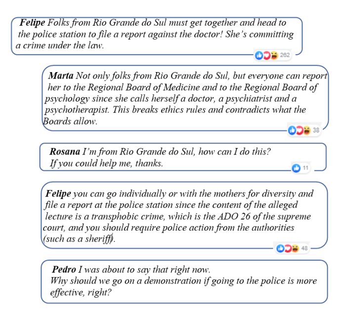
Figure 5. Exchange between Felipe, Marta, Rosana, and Pedro.

In this exchange, the textual trajectory of the controversy about the lecture and its cancellation swerves to scales of a different nature. The interactants' pragmatic work jumps from scales of "democracy" and "science" to scales of law-enforcement and crime. At stake here is the lecture's legitimacy within judicial norms upheld by the State and professional associations such as the Federal Board of Medicine. The repathologization of trans identities is gradually reperspectivized by these commentators through categories of "crime", "justice", "legality", and "ethics". Such measures of qualification and classification are made in such a way that the boundaries between online and offline political action are blurred. In other words, a police report should be filed because Akemi Shiba is committing a crime under the law (i.e. transphobia) and professional misbehavior which is subject to sanction by the FBM and the FBP.