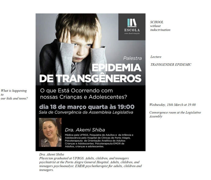
Figure 1. Poster for the "transgender epidemic" lecture

The poster circulated across various online contexts and reached diverse publics and counter-publics. On the website of Articulação Conservadora (Conservative Alliance)<sup>2</sup>, a right-wing group of which the psychiatrist and the lawmaker who organized the event are active members, the poster frames gender variance as an epidemic, which reiterates a pathologizing scale the Brazilian Federal Board of Medicine does not acquiesce any longer. When the poster travelled to social media such as Facebook, however, it was met with diverging positions with regards to the lecture's legitimacy. To draw attention to the lecture, an advertisement was posted on the association's website on February 28<sup>th</sup>, 2020 (see Figure 1 below).