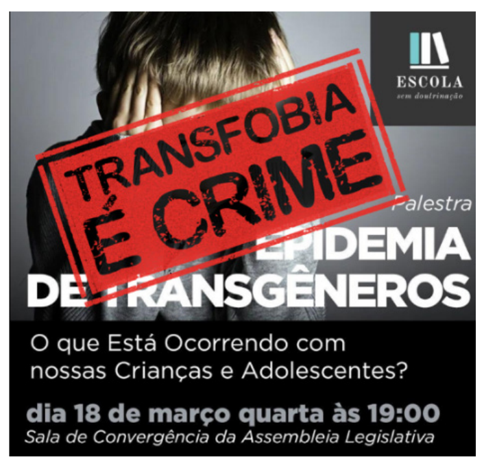
Figure 6. Image from the article in Sul21.

Source: <a href="https://www.sul21.com.br/ultimas-noticias/politica/2020/03/luciana-genro-aciona-ministerio-publico-contra-palestra-sobre-epidemia-de-transgeneros-na-al/">https://www.sul21.com.br/ultimas-noticias/politica/2020/03/luciana-genro-aciona-ministerio-publico-contra-palestra-sobre-epidemia-de-transgeneros-na-al/</a>. Access Jun 8<sup>th</sup>, 2020.