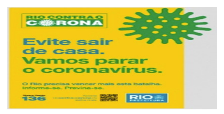
Figure 2. Campaign of the State Government of Rio de Janeiro: "Rio against Coronavirus. Avoid going out. Let's halt Coronavirus. Rio needs to win one more battle. Get informed. Protect yourself."

In spite of their differences, they share two features. Both suggest that social distancing may prevent contamination (as signaled by "avoid gatherings", "stay home" and "avoid going out"). Moreover, they communicate precaution measures in standard Portuguese. These two moves imagine a specific textual itinerary, or communicable cartography (BRIGGS, 2007), which, besides projecting a literate readership, delineates a positive metapragmatic response to it. We can say that the "information map" in these two images, from their very inception, produce asymmetrical relations between core and marginalized regions. They rule out those who are illiterate and the ones who cannot stop working. Gizele Martins, a journalist who lives in Maré, has pondered during an interview by whatsapp: