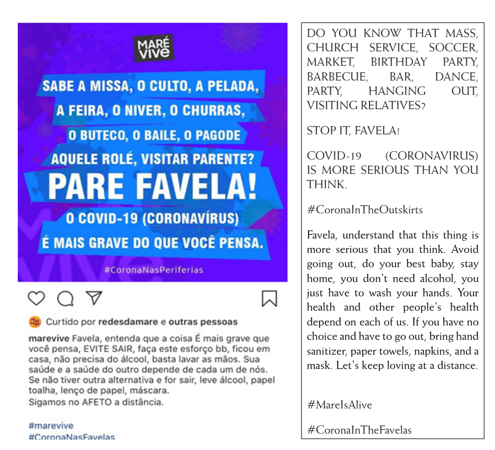
Figure 6. Tweet on MareVive.

It is produced by local journalists for locals. This likely explains the scale-making struggle to create a sense of affinity. Although the blue background may evoke an institutional participant, the overall semiosis sheds light on one category of person. Firstly, direct forms of address (you, your, us, favela, and baby) set all interlocutors within favelas. Secondly, the conversational frame of the question and its content (DO YOUKNOW THAT MASS, CHURCH SERVICE, SOCCER, MARKET, BIRTHDAY PARTY, BARBECUE, BAR, DANCE, PARTY, HANGING OUT, VISITING RELATIVES?) depict addresser and addressees as sharing a similar register associated with a range of social habits. Thirdly, the register deployed includes several indices of expressive language that project a kind of emotional interpellation. Capital letters, different font sizes, punctuation (!), and propositions such as Your health and other people's health depend on each of us and Let's keep loving reframe the summons for