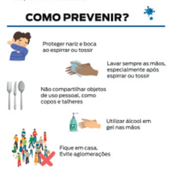
Figure 1. Campaign of the State Government of Rio de Janeiro: Instructions on "How to prevent? Protecting nose and mouth when sneezing or coughing Washing your hands frequently, especially after sneezing or coughing. No sharing of personal objects like glasses and utensils. Using hand sanitizers. Stay home. Avoid gatherings."

For the purposes of this paper we will consider two instances of the campaign of the State Government of Rio de Janeiro, which included a series of charts recommending preventive actions, as the ones in Figures 1 and 2 below. Their semiotic construction selects specific interlocutors, through imagistic resources. One of them is part of a larger poster entitled "NEW CORONAVIRUS" (see Appendix 1). The alternation of black hands and white hands indicates a hierarchy concerning hygiene habits. "Black hands" are advised to be cleaned after coughing and sneezing while "white hands" just need sanitizers to complement their daily grooming. The other circulated as a banner in different parts of the city and on various web pages. It fashions the message in vellow, green, blue and white, the colors of the Brazilian flag, in tune with the nationalist perspective that characterizes the present administration's actions.