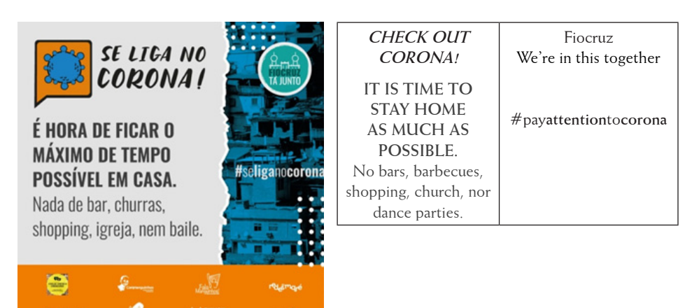
Figure 5. Material available at Fiocruz site suitable for Whatsapp or Instagram posts <a href="https://portal.fiocruz.br/sites/portal.fiocruz.br/files/imagensPortal/posts-se-liga-no-corona_1000x1000px_02_0.jpg">https://portal.fiocruz.br/sites/portal.fiocruz.br/files/imagensPortal/posts-se-liga-no-corona_1000x1000px_02_0.jpg</a>

As a communicative practice, the poster interlaces two register models. One of them is more informal. Its semiotic design deploys popular expressions such as Se liga no Corona! (Check out Corona!). The use of italics and bold types, the imperative form, and the exclamation mark compose an emphatic call for action that suggests features of orality and informality. As such it contextualizes the warning in No bars, barbecues, shopping, church, nor dance parties . These references to identifiable locales and leisure activities anchor the message in the day-to-day time-space of the favela. One of the possible effects of this sign assemblage is to position text producers and consumers on an equal footing.