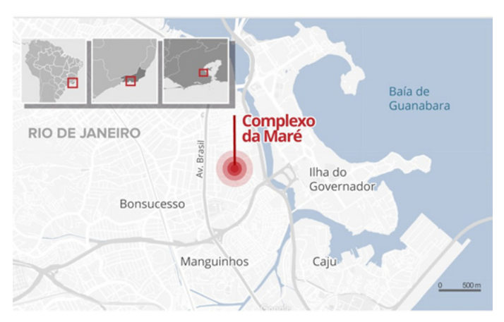
Figure 3. Complexo da Maré Map<sup>2</sup>

With 140 thousand residents, the Complexo da Maré is the 9th most populated district and the largest group of favelas in the city of Rio de Janeiro, occupying an area of 5 kilometers. This space, whose population was first recorded in the 1940's, is a cluster of 16 favelas and jumbled homes located in a maze of narrow streets in the North region of the city (see map in Figure 3). As is characteristic of other similar communities in Brazil, Maré faces economic and financial vulnerability, and lack of investment in health, education, and basic services.