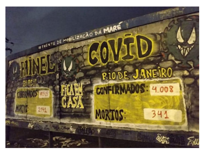
Figure 4. Graffiti wall in Maré by Rafael Cruz.8