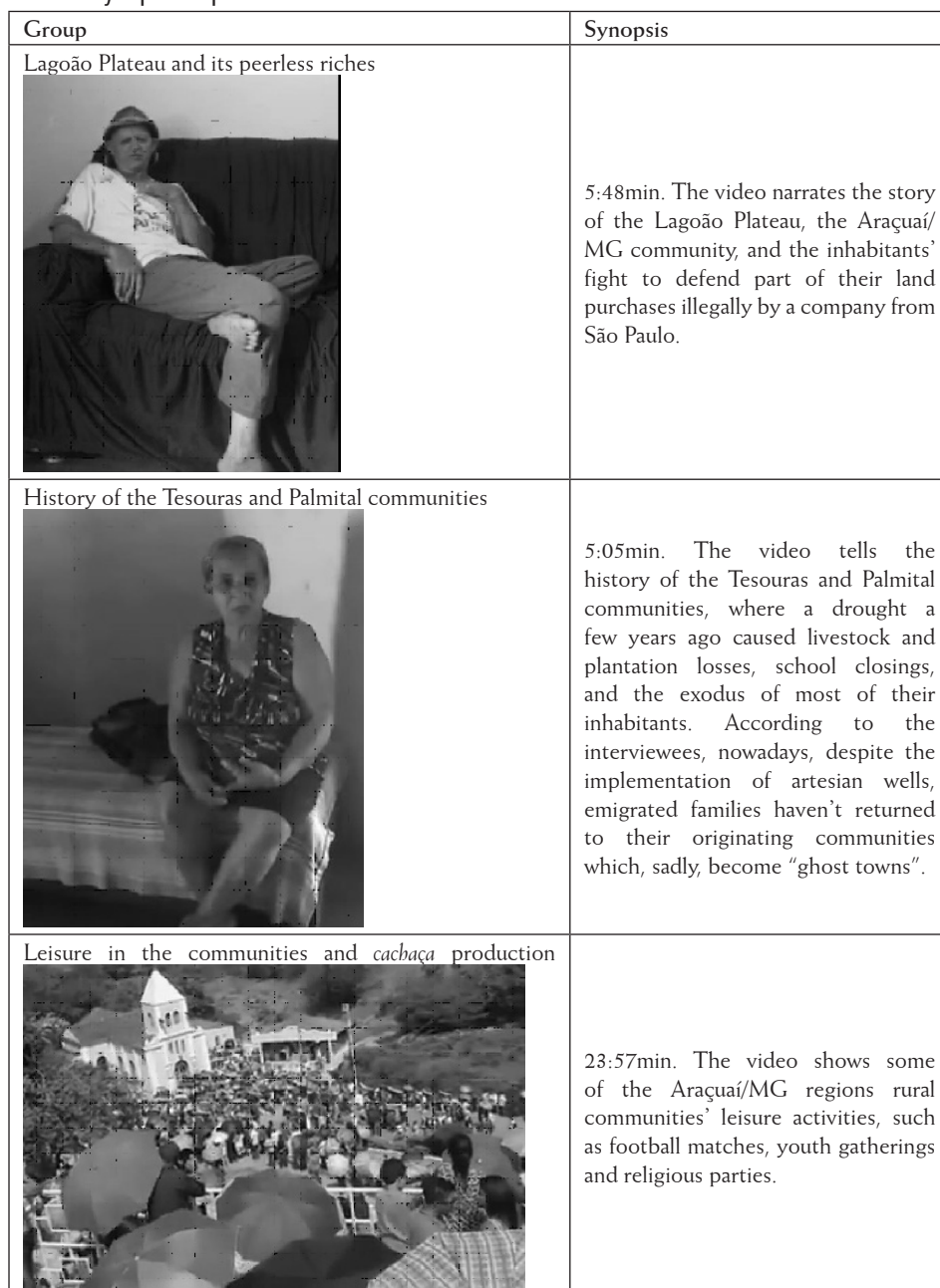
Table 2. Synopsis of produced videos