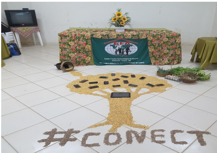
Figure 1. Photo #conect