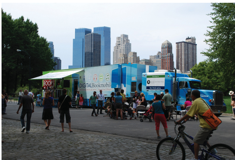
Figure 5 - Urban mobile library