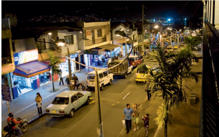
Figure 6 - Enhanced public life in Medellín, Colombia