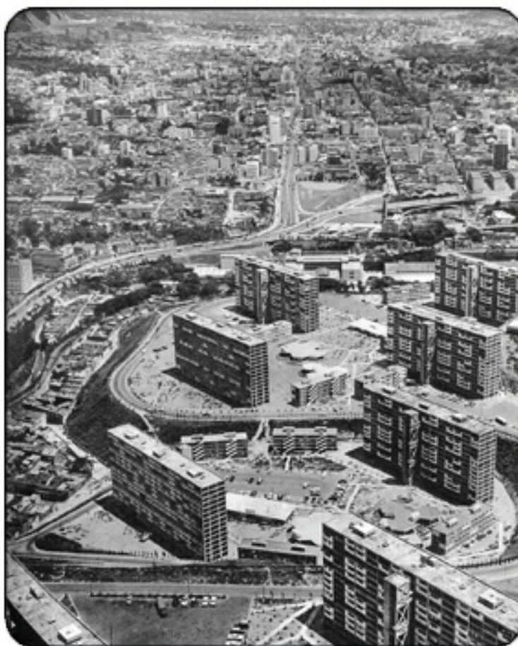
Figure 2 - The Super Bloque of January 23 shortly after construction

The contemporary exacerbation of urban insecurity in Caracas can be significantly attributed to processes of spatial organization that have occurred since the early 20 th century. By the beginning of the 1930s, oil and the state had come to dominate the economy and processes of urban expansion in Caracas (BRICEÑO-LEÓN, 2007). Programs such as the Plan Rotival , which sought to order urban expansion through a system of straight boulevards and diagonal avenues, epitomized this trend, as government policy reserved the city center for commercial and office use and pushed the metropolis into its modern linear shape, which made urban transportation necessary for city life (STANN, 1975). The purchase of large single tracts of land in the city’s east and their simultaneous subdivision and development into housing at a relatively narrow