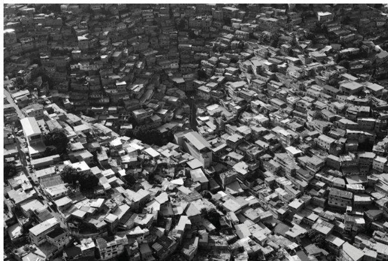
Figure 3 - The extreme congestion of the barrios

[...] a process of generalized urban deterioration set in, where congestion and decline, [caused] by the decreasing availability of urban plots, [saw] families resort to building 2, 3, or even 7 stories on to already precarious dwellings [...] (BRICEÑO-LEÓN, 2007, p. 99).