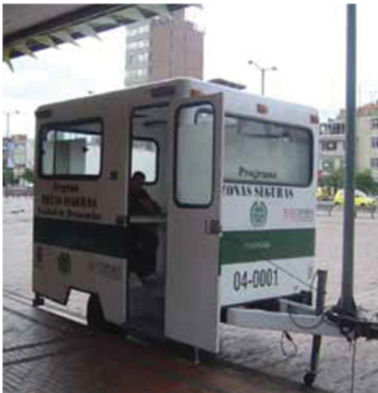
Figure 4 - Mobile police facility, Bogotá, Colombia