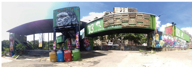
Figure 7 - Labrotorio de Artes Urbano , El Valle, Caracas

Accordingly, spatial intervention should focus on enhancing the accessibility of recreational facilities since exposure to such facilities offers the opportunity to form social norms while providing verbal skills that enable individuals to “[...] express feelings and manage conflicts through negotiation and agreement [...]” (BRICEÑO-LEÓN, 2005, p. 1643). Precedent for such facilities can be drawn from existing programs, including the initiative Labrotorio de Artes Urbano (Tiuna El Fuerte) in Caracas, which provides a space in which the values of creativity, expression, and respect are encouraged in young urban inhabitants (Figure 7) (LABROTORIO DE ARTES URBANO, 2013). Through programs including instruction on graffiti artwork, music, radio broadcasting, and dance as well as other artistic media, Tiuna El Fuerte has been able to reach a substantial portion of local adolescents who do not attend school or participate in athletic or cultural activities. Furthermore, Tiuna El Fuerte programs encourage youth to amend the spaces of the facility to represent the culture of their