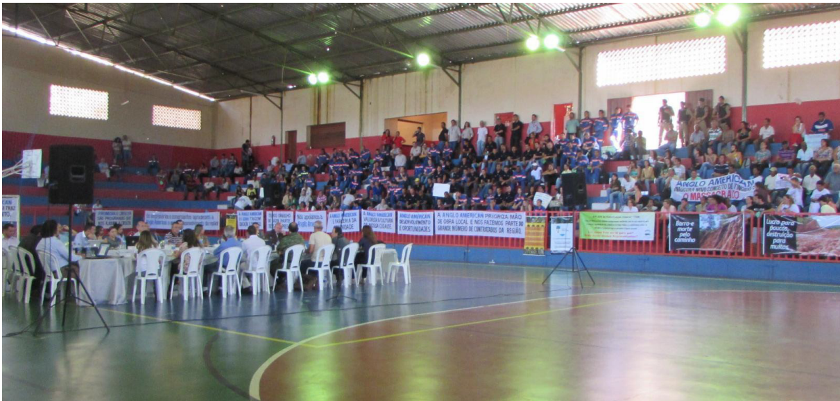
Figure 1 – Photos 1 e 2 of the 86 th Ordinary Meeting of the Jequitinhonha Regional Colegial Unit (URC), 29 September, 2014.

On the improvised stage into which the court had been transformed, the tables, organized in the shape of a U, were facing the audience. They were reserved for members of the Environmental Policy Council of Minas Gerais (COPAM). More precisely, they were reserved for Council members of one of the regional units, that of the Jequitinhonha region, responsible for the licensing of “extraction and wet processing of open-mine iron ore, in the municipalities of Conceição do Mato Dentro, Alvorada de Minas and Dom Joaquim” (Minas Gerais 2014: 04). During this event, Council members, and representatives of civic and governmental agencies participated in the process for approval of the Operational License of the mine, which was part of the Minas-Rio Project ( Projeto Minas-Rio ) for more than 12 hours without interruption.