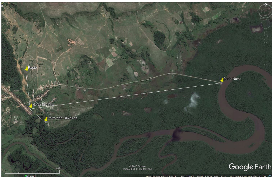
Spatial range of some of the activities carried out by Silvinha in Jaraguá village

Elaborated by the author, using the Google Earth programme, 2017.