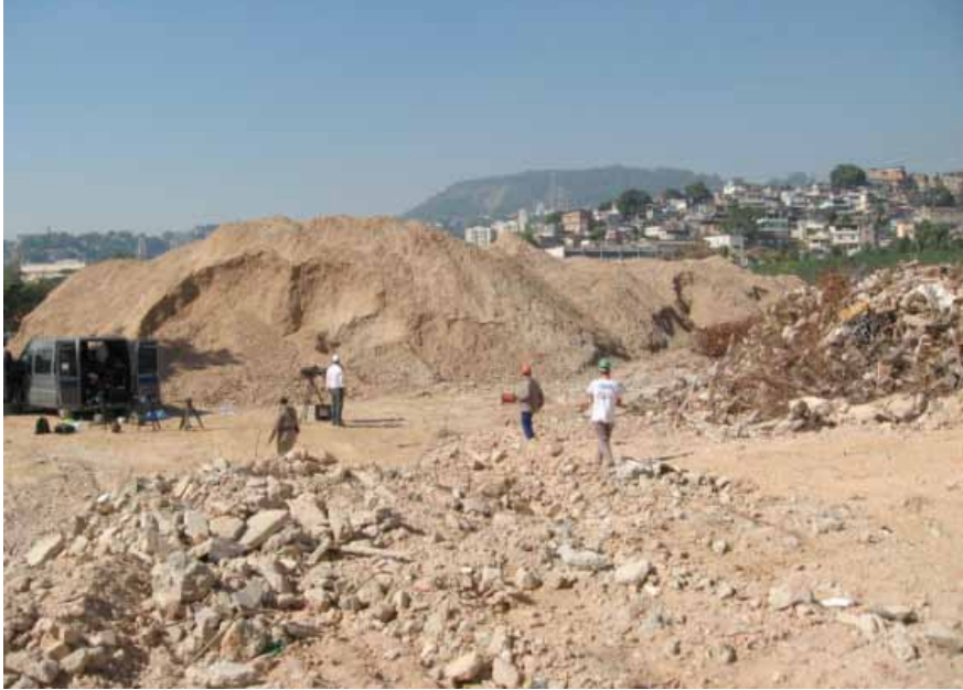
Figure 9 – Long red wire being unwind.

Scattered throughout the area, including inside the drain pipes and even inside the building, there are microphones, photo cameras, film cameras and seismometers, all pointing towards the wrapped building. 24