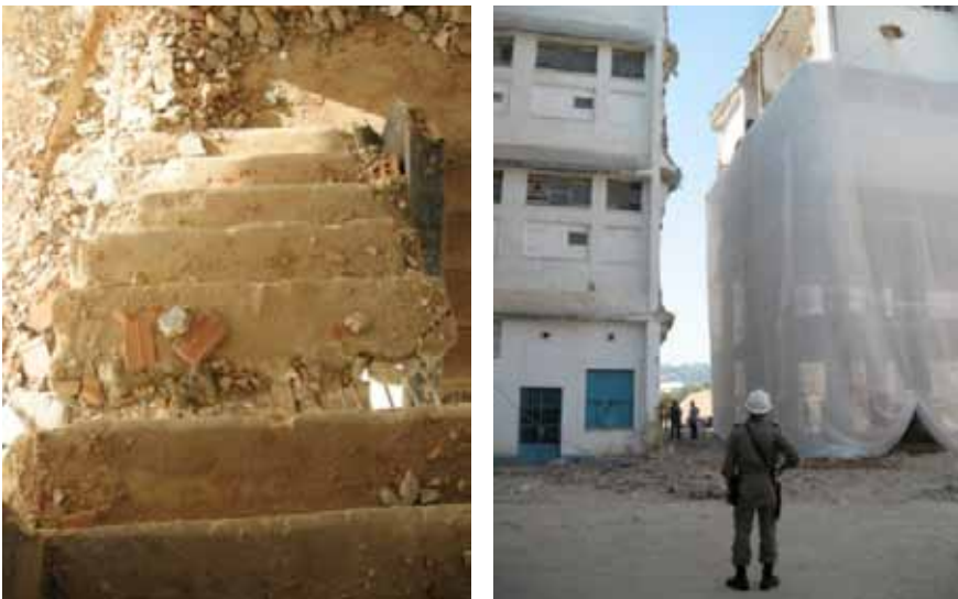
Figure 6 – The ethnography’s battlefield.

the ones that had only the stair hardware, I found one of the engineers responsible for the operation, standing in a floor full of debris. He was Engineer 1's son, who had authorised my entrance in this fenced and restricted area. On that same floor, there were also four or five workers with helmets around a column. They were drilling into it at various points. They carefully handled coloured wires and a kind of white paste which, I would later find out, were the detonation wires and gases that would be mixed with a gelatinous nitroglycerine compound and explosives: dynamite. I had the impression they were setting up “traps” in a mine field and I paid extra attention as I walked.