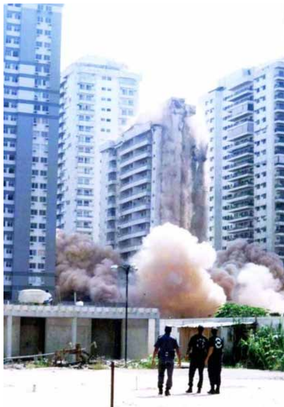
Figure 4 – Implosion of the Palace II building 7 .

At the company's reception hall, an enormous photograph covered one of the lateral walls from end to end. A twenty-three floor building, the Palace II , had been captured at the precise moment of detonation, just prior to its complete collapse. It was a very different type of architectonic image to those I had become accustomed. Neither in black and white, nor static. As I waited to be taken into Engineer 1's office, I thought: "I am faced with the image of a moving building!".