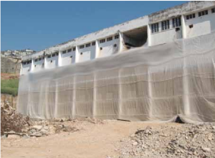
Figure 10 – The Building's last instants.

Similar to a theater play, the third of three sound signals is finally given. Weeks of preparation come to an end. The building would now thoroughly "perform" the "role" it was given. The honor of pressing the trigger is then granted to a state representative, the president-director for the state Housing Company, precisely the one in charge of the housing construction that will occupy the area once the prison wreckage is removed. The count-down begins.