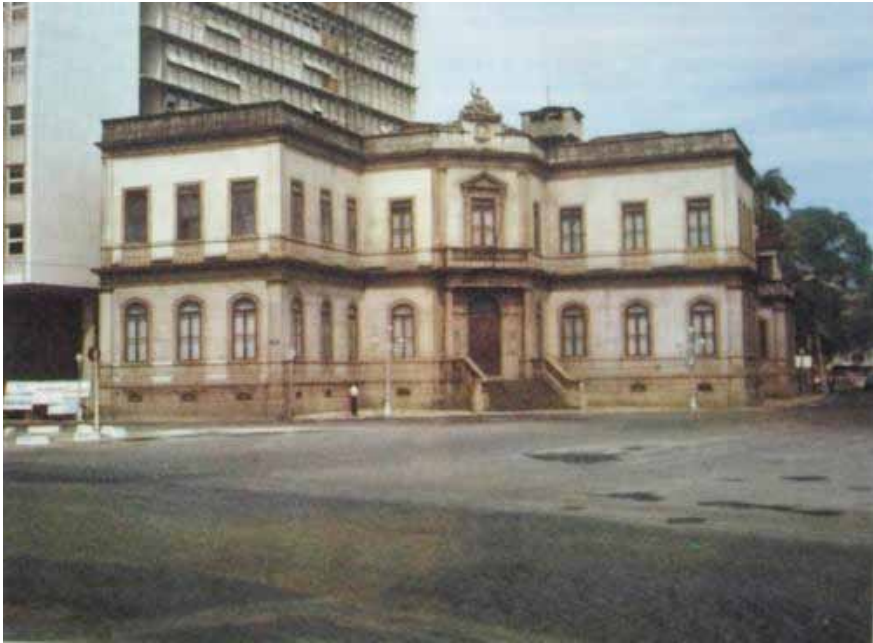
Figure 3 - IHGB building at the beginning of the 1970s. 15

One could rebut and say that those who carry out demolitions could, in the end, be closer to the representations that we might have of “gravediggers,” rather than “criminals.” 16 I don’t believe it matters too much. Whether carried out by contractors, assassins, surgeons or gravediggers, the demolition of a building is a process that takes place uninterrupted. From its construction to the removal of the last debris, passing through the paper decrees ordering a demolition, these steps form a complex network of imbricated decisions. Each of them could have altered very much the final result.