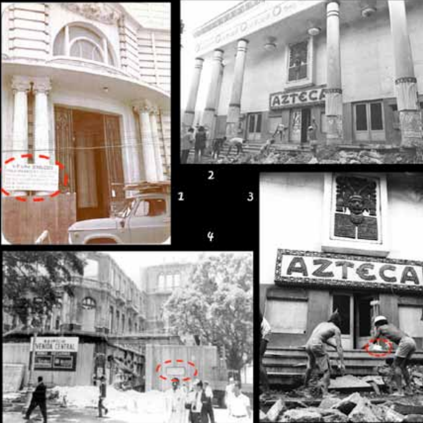
Picture 1: Demolition of the Brazilian Ministry of Agriculture. Praça XV Square, 1978. Pictures 2 and 3: Demolition of the Cinema Azteca. Catete Street, 1979. Picture 4: Demolition of the Hotel Avenida. Rio Branco Avenue, 1957.