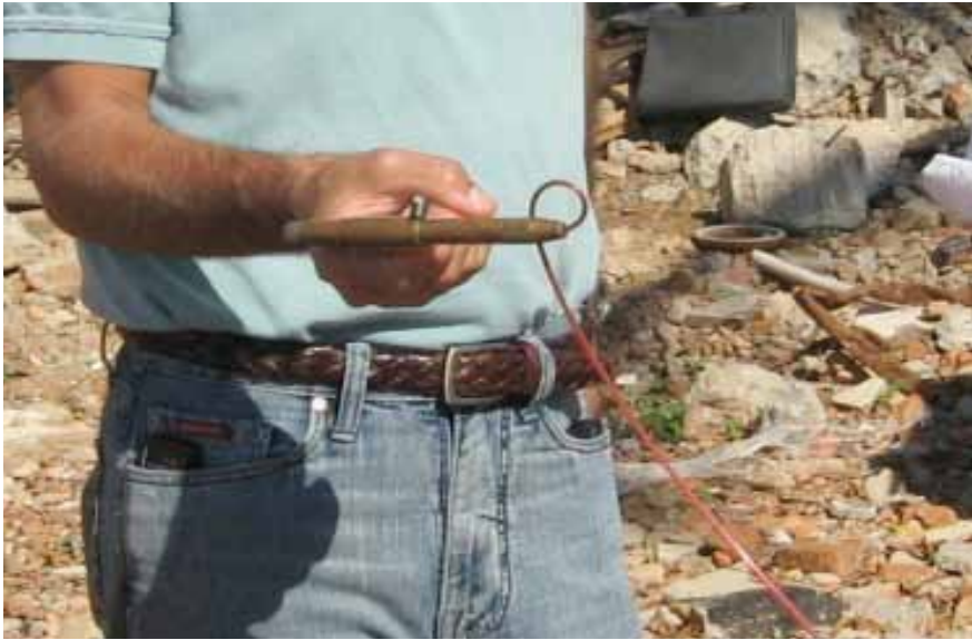
Figure 11 – Farewell weapon.

Two or three minutes after noon, a light snap could be heard and the detonation seems to have failed. The engineer abruptly takes the pistol from the hands of the honoured guest, swiftly handles the weapon and, with the appropriate skill, presses the trigger once again. This time, one hears a monumental rumble and the four-story building can be seen moving as if from the outside in .