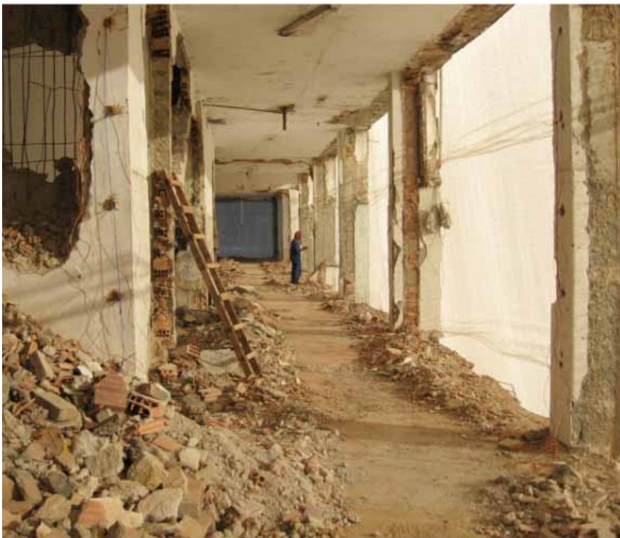
Figure 5 – The building’s ground floor and a ladder.

The scene is a curious one: a demolition that had begun with the inmates (illegally and from the inside, in secret stratagems) would now end, in a spectacular form, with the explosive calculations (equally occult) of workers (engineers, supervisors, hammer drill operators and laborers) concerned with this particular stage of an urban intervention.