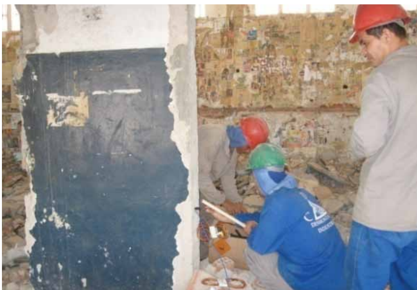
Figure 8 – Dynamite placement.

My first impressions of this warlike scenario were then abruptly replaced by the disturbing and frightening thoughts on prison life. On a bed, an inmate's geography textbook with notes and exercises. In the cell in front, three playing cards grouped in a corner, two facing upwards and one downwards. On another corner, papers and lists of names. All of those material traces, the smell of the cells and the sight of improvised electrical wiring and curtains provided fertile material for the visitor's imagination. As highlighted in the comments I heard from the documentary filmmakers, as well as from the company workers, it was impossible not to be affected or even "contaminated" by the lives and sociability that had, not long ago, occupied that scenario. As one of the team members pointed out, the preparations for an implosion do have something of an "indiciary" or archeological procedure. 22