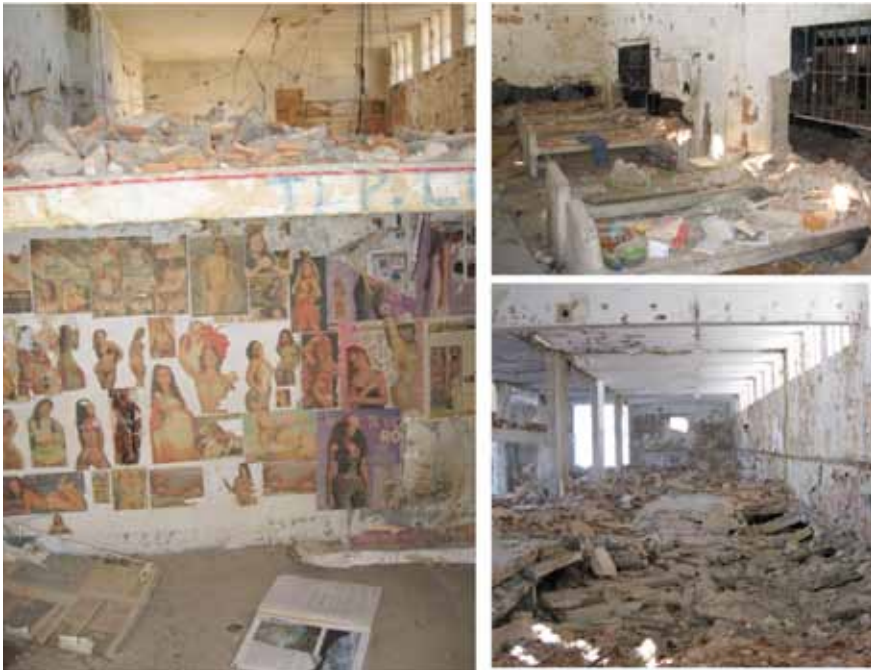
Figure 7 – Interior decoration.

Still on the second floor, apart from the debris that also completely covered it, one could see a giant collage of pictures, framed by a trail of partitions that no longer existed. Up close, one could distinguish a series of erotic, and even pornographic photographs mixed with newspaper cut-outs with all sorts of articles, automobile and perfume ads, photos of escolas de samba (samba schools) and sports teams, as well as football score tables.