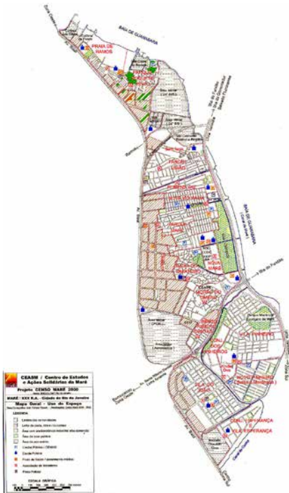
Figure 1: General map of Maré.