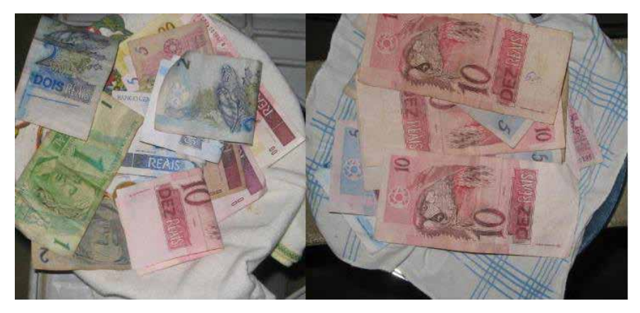
Photo 1: Cantorias at Biu Ambrósio's bar (2006) Photo 2: Cantoria at the house of Mrs. Irene, at the Poço Grande ranch (2006).