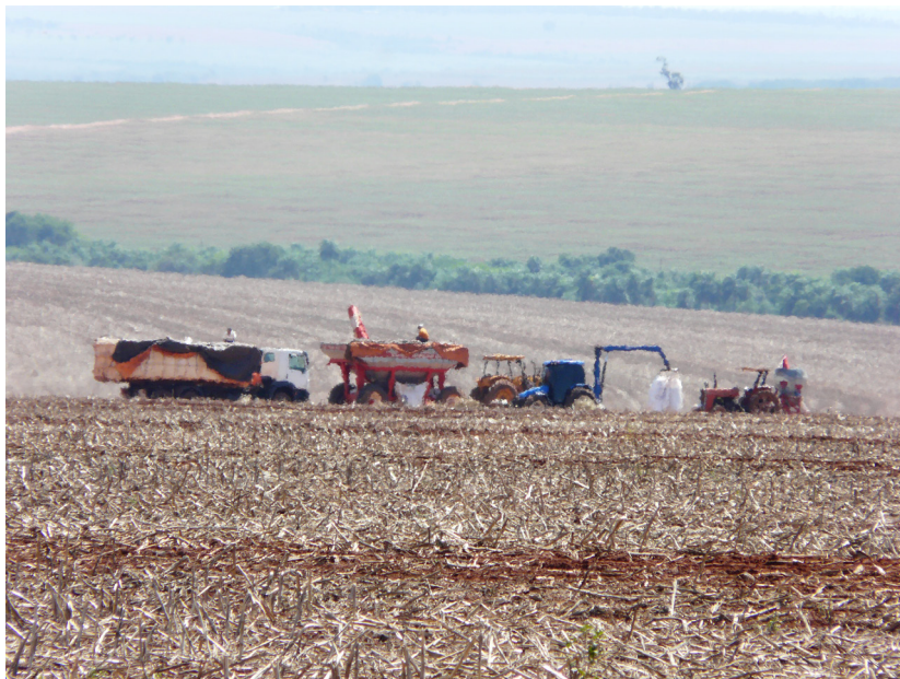
Figure 2 – Agribusiness production in Mato Grosso do Sul in areas grabbed from the Kaiowa-Guarani