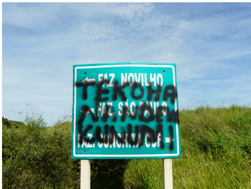
Figure 8 –Indigenous name of the land painted over farm signposts