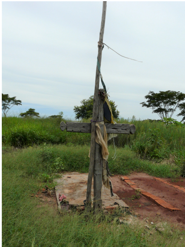
Figure 3 – Graves of indigenous people killed by farmers in Caarapó