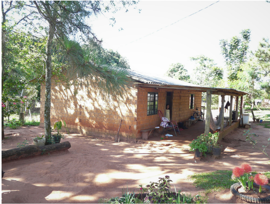
Figure 4 – Indigenous family household in the Pirajuí Reserve