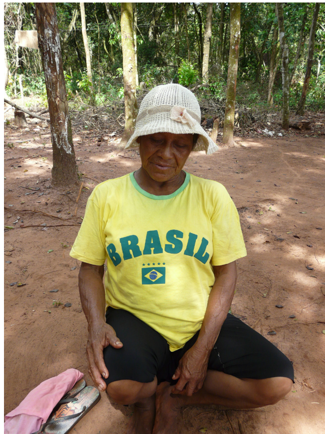
Figure 9 – Indigenous woman in a retomada