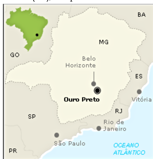
Map 1 –The Minas Gerais state (MG), its capital Belo Horizonte and the Ouro Preto location