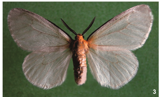
Figures 1-3. Eloria subapicalis : (1) caterpillar on Erythroxylum suberosum in the cerrado area at Fazenda Água Limpa, Experimental Station, Distrito Federal, Brazil; (2) pupa cocoon; (3) adult.

A total of 54 E. subapicalis caterpillars were found on 5,150 plants examined during the first period of sampling, of which 50% were located on E. tortuosum , 46% on E. suberosum and 4% on E. deciduum . No caterpillar was found on E. campestre during the second period of sampling. In the third period of sampling (4,196 plants examined) only seven caterpillars were found between January and March 2006, all on mature leaves of E. tortuosum and only in the burned portion of the study site.