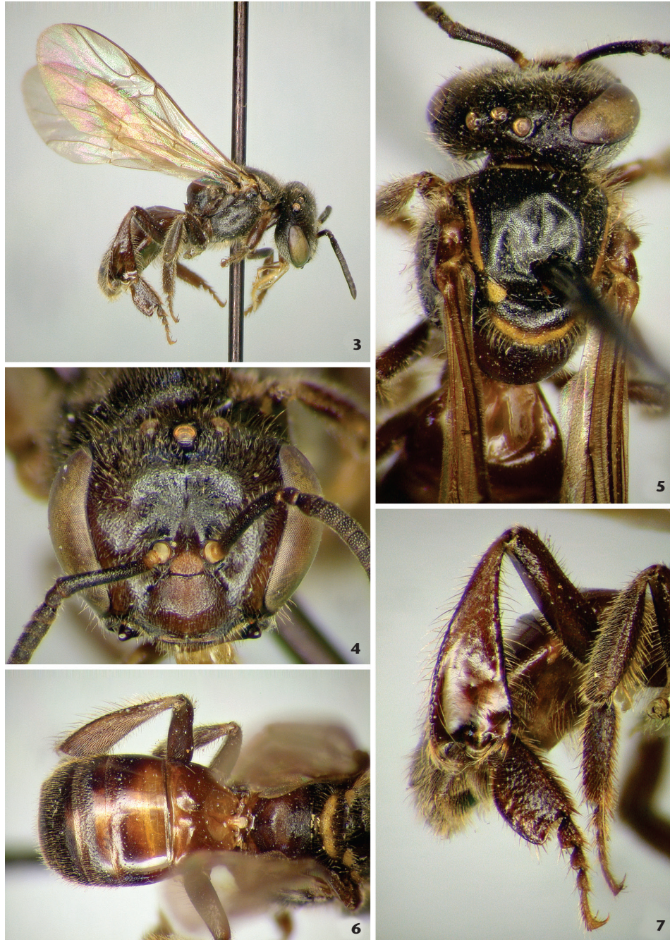
Figures 3-7. Holotype worker of Trigona nigrifacies Friese, 1900: (3) habitus, side view; (4) head, frontal view; (5) head and mesosoma, dorsal view; (6) metasoma, dorsal view; (7) hind leg, side view.

side of mesoscutum, axilla, distal margin of scutellum, apex of fore femur and basis of all tibiae. e) Vestiture: erect hairs on body uniformly pale-yellow to light brown, darker on inner surface of tarsi, mostly simple, except on pronotal lobe, tegula, anterior margin of mesoscutum and along anterior portion