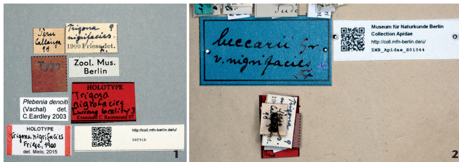
Figures 1-2. Plectoplebeia nigrifacies : (1) labels of the holotype of Trigona nigrifacies Friese, 1900; (2) place under which the holotype of T. nigrifacies was found in the ZMB collection.

Description. Worker. a) Body length about 5.5 to 6.0 mm. b) integument between punctures mostly smooth and shiny, fine rugulosity present on parts of head and mesosoma; metapostnotum with fine transverse rugulosity along basal portion and on middle of dorsal area, remainder finely areolate to reticulate. c) Body dark brown to black except for vestiture and markings described below; mesoscutum black; wing membrane light brown infumated. d) Yellow markings obscured on head, with most of mandible, broad stripe on mid of clypeus, lower parocular area and supraclypeal area dark reddish brown; on mesosoma, yellow markings as follows: a transverse stripe on pronotum, a spot on the pronotal lobe, one stripe on each