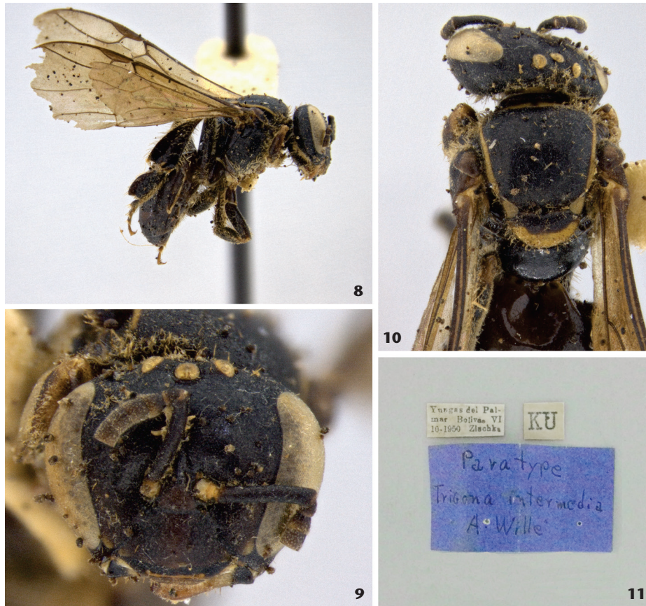
Figures 8-11. Paratype worker of Trigona (Plebeia) intermedia Wille, 1960: (8) habitus, side view; (9) head, frontal view; (10) head and mesosoma, dorsal view; (11) specimen labels.

with long, curled, simple setae; setae on metasomal sterna simple. f) Head ca. 1.2x wider than long, about as wide as mesosoma; maximum interorbital distance about 1.15x greater than length of eye; inner orbit of eye slightly convergent below, upper interorbital distance ca. 1.2x the lower distance; upper alveolar tangent at middle of face; vertex rounded, not forming post-ocellar carina; malar space moderate, approximately 5/8 of diameter of third flagellomere ; preoccipital ridge indicated as a low carina on upper part of head, on lateral portion rounded; gena, at side view, about as wide as compound eye. g) Clypeus 2.0x wider than long, convex; epistomal suture, between subantennal sutures a widely open V; supraclypeal area lacking modifications, not forming a flange at each side; mid portion of lower frons, adjacent to antennal sockets, slightly depressed and forming a shallow scapal basin . h) Labrum normal. i) Mandible bidentate. j) Scape slightly longer than alveolo-ocellar distance and slightly narrower than diameter of third flagellomere; pedicel and third flagellomere, respectively, as wide as long. k) Pronotum short, ca. 0.6 x length of scutellum; anterior margin normal, not emarginate, bordered by a short translucent lamella. l) Scutellum short,