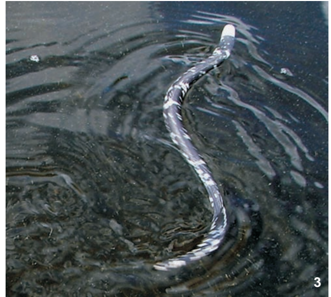
Figures 2-3. (2) Amphisbaena alba in serpentine movements in the Baía de Caxiuana, Portel, Pará; (3) A. amazonica in serpentine undulations in the Igarapé Marinaú, Portel, Pará. Note the head of the specimen above water.