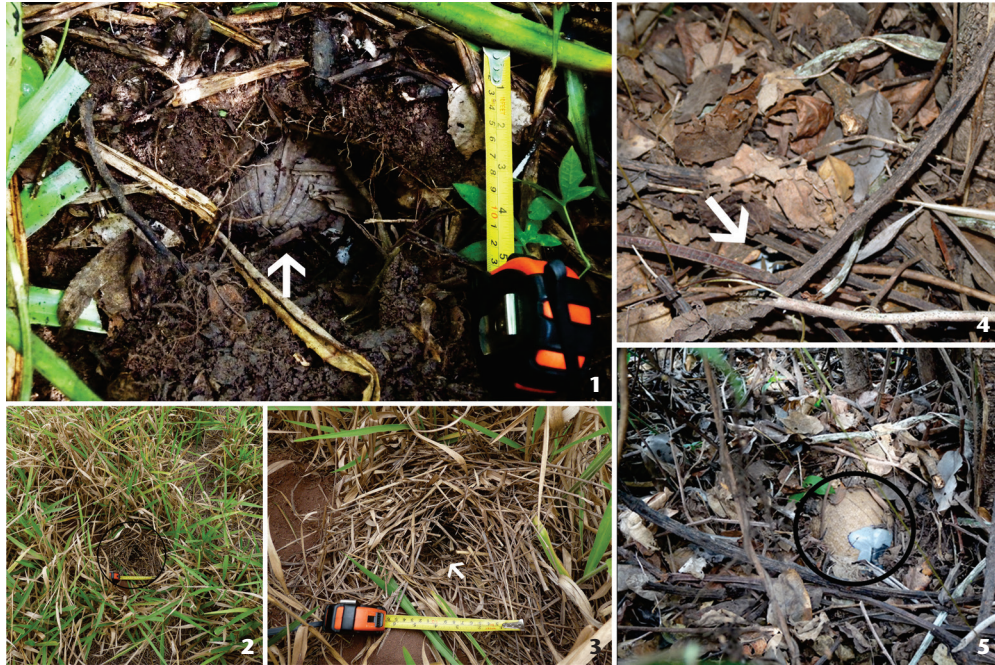
Figures 1-5. (1) An individual of Tolypeutes matacus (arrow) resting inside its burrow at Santa Teresa Ranch, Corumbá, Mato Grosso do Sul. (2-3) Straw-nest built by T. matacus in a pasture area at Duas Lagoas Ranch, Cáceres, Mato Grosso: (2) upper view of the nest (circle) and (3) close-up of the same nest (arrow indicates the entrance of the nest). (4-5) (4) An almost imperceptible individual of T. matacus resting in a depression under leaf litter at Santa Teresa Ranch, Corumbá. The arrow points to the only visible part of the carapace. (5) The same GPS-fitted animal resting in the depression after we manually removed some of the leaf litter to expose part of its carapace (circled).

Despite the occurrence of three other armadillo species – Euphractus sexcinctus (Linnaeus, 1758), Cabassous unicinctus (Linnaeus, 1758) and Dasyus novemcinctus Linnaeus, 1758) – and at least four other burrowing animals (iguanas, agoutis, pacas and the spiny rat) at our study sites, T. matacus was never found using burrows resembling those belonging to other species.