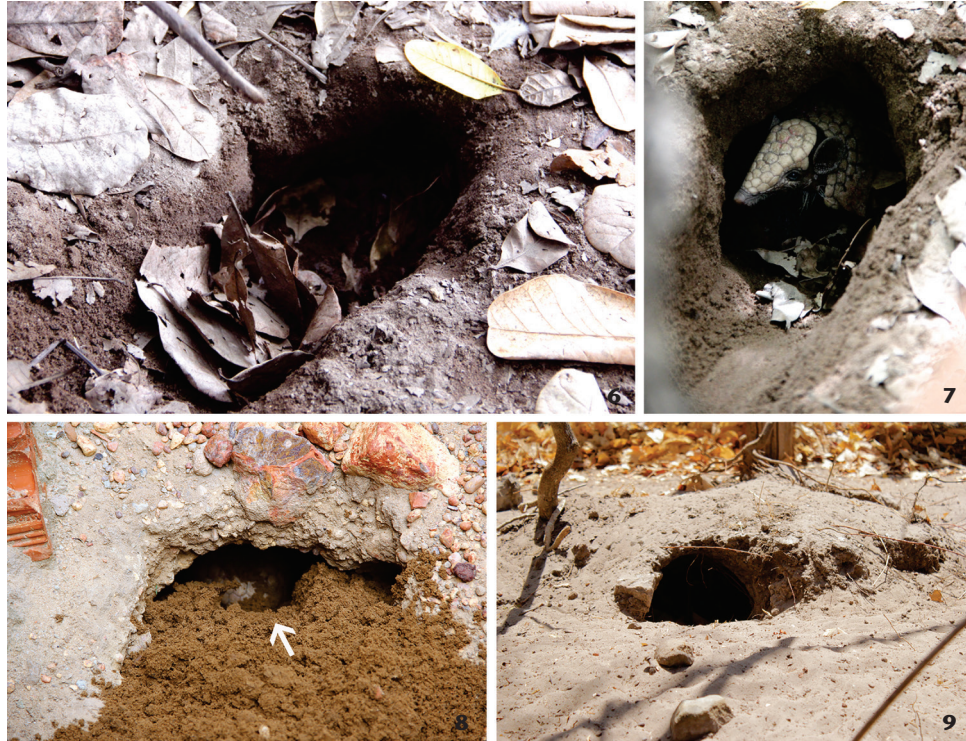
Figures 6-9. (6) Burrow of Tolypeutes tricinctus with entrance covered by leaves at Buriti dos Montes, Piauí. (7) Animal leaving the burrow after removal of the leaf litter cover. (8) An individual of T. tricinctus actively digging as an escape behavior at Buriti dos Montes. (9) Burrow dug by T. tricinctus in semi-captive conditions at Reserva Natural Serra das Almas, Ceará.

the individuals of Tolypeutes were found are congruent with the animal size and carapace shape. When observing animals entering and exiting the small burrows, the perfect congruence of the shape of the carapace and that of the burrow is evident (Appendices S2* and S3*).