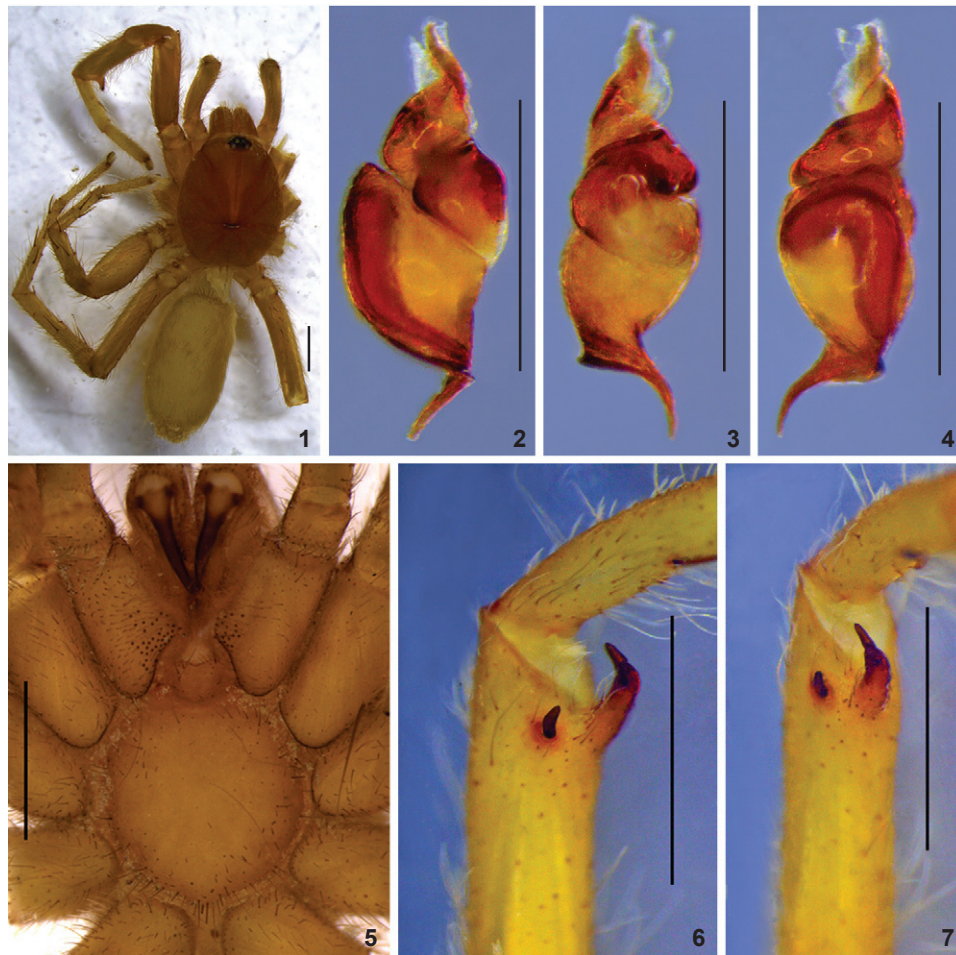
Figures 1-7. Tmesiphantes mirim sp. nov. male holotype (IBSP 9954): (1) dorsal habitus; (2-4) male palpal bulb: (2) prolateral view; (3) retrolateral view; (4) dorsal view; (5) cephalotorax, ventral view; (6-7) tibial apophysis; (6) lateral view; (7) ventral view. Scale bars: 1, 5-7 = 1 mm, 2-4 = 0.5 mm.