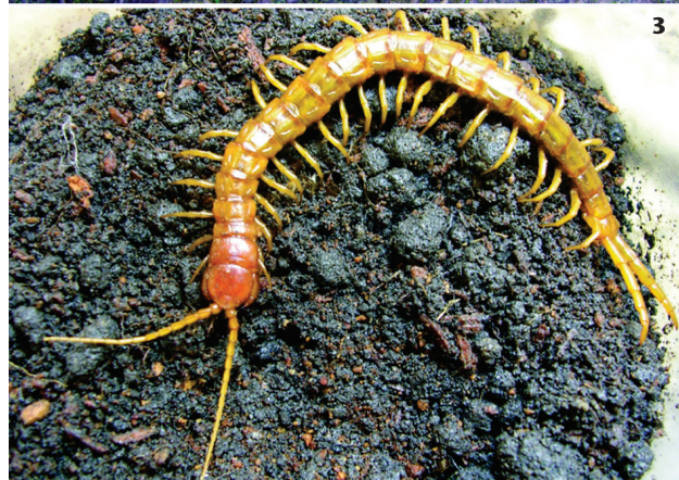
Figures 1-3. Species of Scolopendromorpha used for the experiments of predatory behavior mapping and description: (1) Scolopendra viridicornis ; (2) Otostigmus tibialis ; (3) Cryptops iheringi .

residues left in the air or substrate, or even the direct touch of the prey on the centipede).