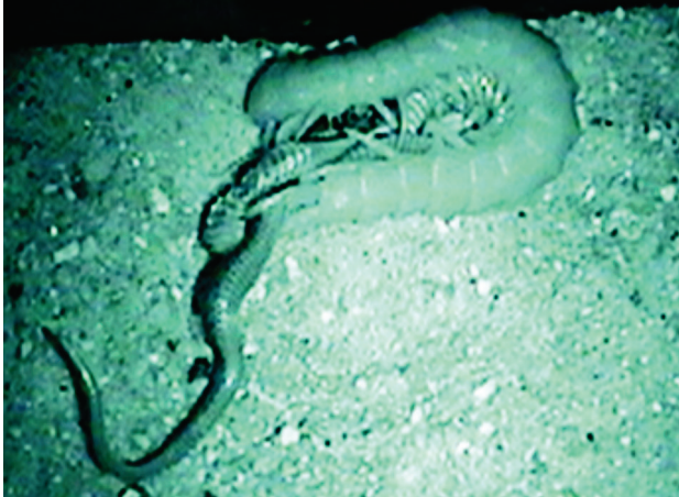
Figure 5. Image captured by video camera during predation by centipedes during experiments conducted to map and describe predatory behavior of three centipede species of the order Scolopendromorpha.

However, contact with beetles of this species induced the animals to rub prey several times against the substrate. This act may be related to the presence of spines on the legs of the beetles.