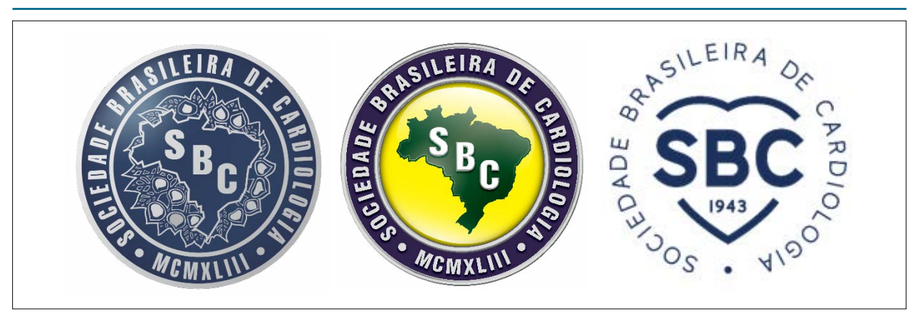
Figure 2 - Different SBC logos throughout its history.

This new decade emerges with a new design for Cardiology in a digital, connected, patient-focused environment, based on major pillars – artificial intelligence, big-data, robotics, biosensors, telemedicine, devices, sensors and genomics. Together they will support the Precision Cardiology paradigm. The need to incorporate into our mindset the idea of the cardiologist approaching the world of innovation and entrepreneurship is a new challenge in the formation of our new cardiologists with emphasis on the development of female leadership in cardiology. From the assistance point of view, our integration with the population health and family doctors will increase, as well as our multidisciplinary approaches, enabling the implementation of lines of care and the monitoring of clinical outcomes and focused on patient safety. This means to know and dominate the triad