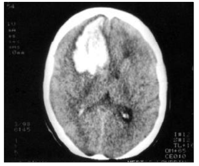
Fig. 3 - Hemorrhagic transformation of the ischemic cerebral infarction. The computed tomography of the skull shows an extensive hemorrhagic area in the cortical region of the right frontal lobe in the same site of the previous ischemic area caused by embolism.

The incidence of pneumococcal endocarditis is not entirely known because the literature available comprises only reports of cases and series with a small number of patients. In the preantibiotic era, the Streptococcus pneumo niae accounted for approximately 15% of the cases of infectious endocarditis<sup>1</sup>. With the appearance of penicillin, a reduction has occurred and the current incidence ranges from