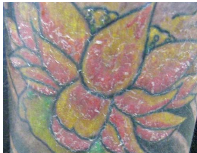
FIGURE 4: Hyperkeratotic nodulations over the red pigment