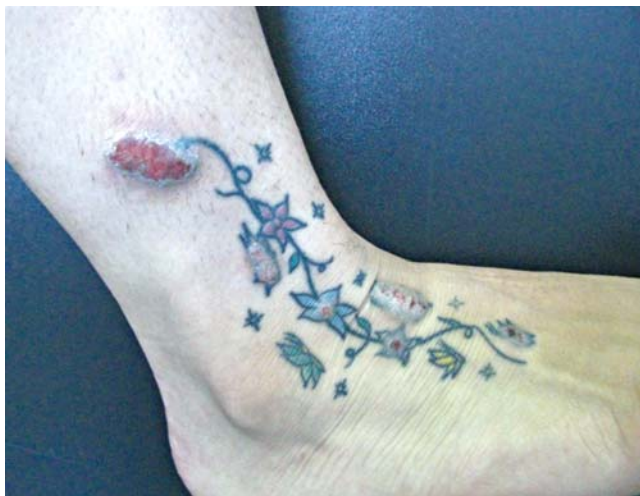
FIGURE 1: Lichenified, excoriated plaques located over the red pigment