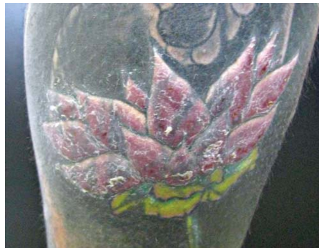
FIGURE 3: Hyperkeratotic nodulations over the purple pigment