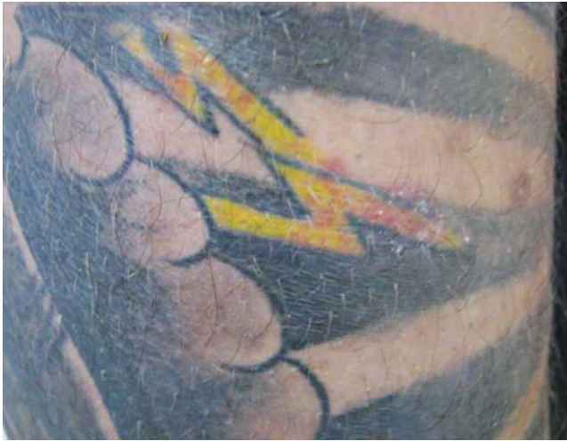
FIGURE 5: Erythematous papules over the yellow pigment: a photo-induced reaction