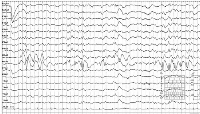
FIGURE 1. Bioccipital spike-waves on unipolar montage in Case 1