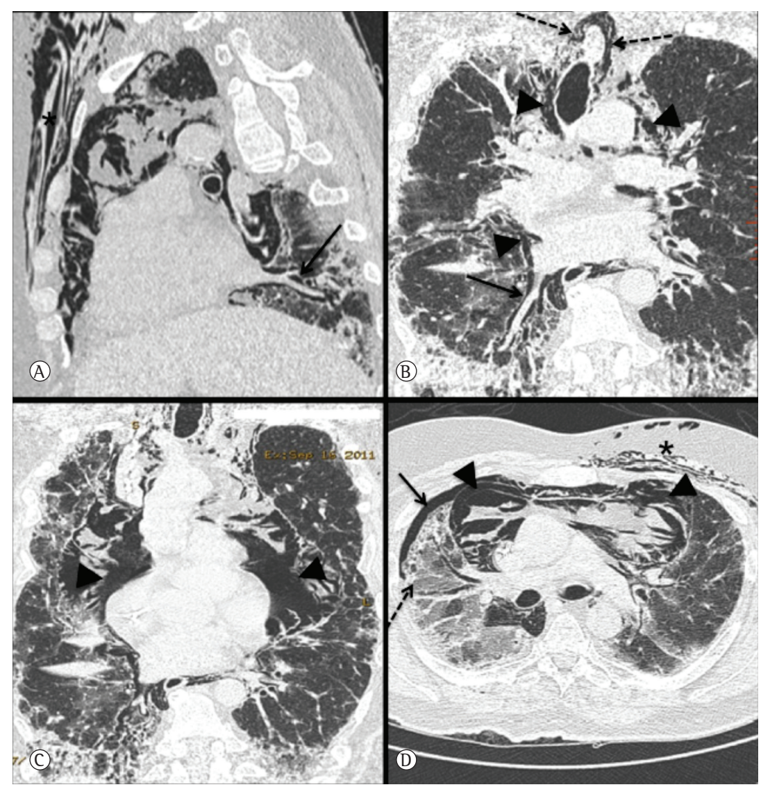
Figure 3 – In A, oblique sagittal reformatted HRCT scan showing air dissecting within the lung interstitium along the right inferior pulmonary vein (arrow) and entering the mediastinum. In B, curved coronal reformatted HRCT scan showing the upward path of the air around the right inferior pulmonary vein (arrow) into the pneumomediastinum (arrowheads). Note the integration between the pneumomediastinum and the cervical emphysema (dashed arrows). In C, curved coronal reformatted HRCT scan showing the large amount of air that dissects along the mediastinal fat planes and pneumomediastinum (arrowheads). In D, axial HRCT scan showing pneumomediastinum (arrowheads) associated with chest wall emphysema (asterisk, also found in A). Note also a small right pneumothorax (arrow), as well as reticular lung opacities and areas of ground-glass opacity (dashed arrow).

This chain of events was described by Macklin & Macklin in the 1940s.<sup>(3)</sup> Those authors demonstrated that most air leak syndromes did not result from rupture of subpleural bullae, but rather from alveolar rupture. In addition, they introduced the concept that the presence of positive pressure within the alveoli is not necessary for rupture to occur. What is essential is the pressure gradient