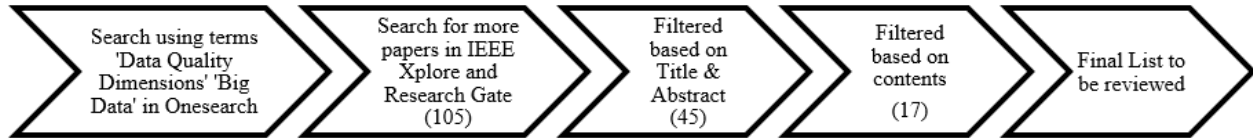
Figure 3. Methodology followed for Literature Search