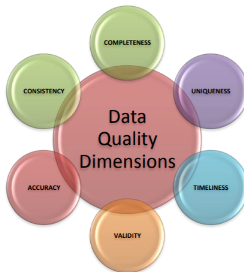
Figure 1. Data Quality Dimensions adapted from (DAMA, 2013)